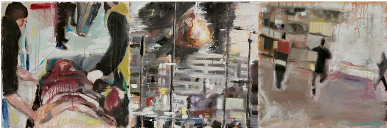
Crisis? What Crisis? by Caoimhghin Ó Croidheáin

Galleries exhibit endless lines and squares, all imaginable shapes and colors. In several galleries, I observe abstract, Pollock-style ‘art’. I ask owners of the galleries, whether they know about some exhibitions that are concentrating on the plight of tens of thousands of homeless people who are barely surviving the harsh Parisian winter. Are there painters and photographers exposing monstrous slums under the highway and railroad bridges? And what about French military and intelligence adventures in Africa, those that are ruining millions of human lives? Are there artists who are fighting against France becoming one of the leading centers of the Empire? [...] No new symphonies or operas dedicated to the victims of Papua, Kashmir, Palestine, Libya, Mali, Somalia, the Democratic Republic of Congo, or Iraq.[1]