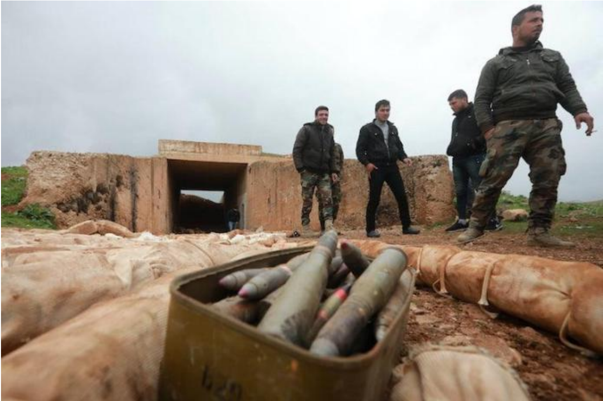
NATO weapons left behind by ISIS in Syrian government-liberated territory in Daraa.

The Obama administration had told the U.S. public that the U.S. was arming only “moderate [anti-Assad] rebels,” when there were no moderate rebels—they were all part of ISIS, al-Nusra and other al-Qaeda affiliates in Syria.