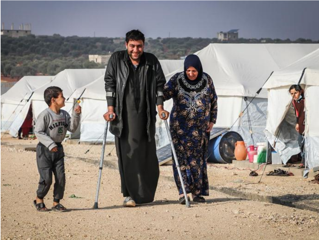
War amputee in tent city in Syria where the internally displaced live.

The U.S. media blame the biblical-scale catastrophe on Syria's President Bashar al-Assad.