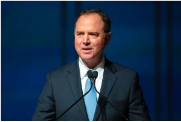
Image on the right: Adam Schiff

One can imagine an American CNN viewer fed the Washington propaganda of Russia evil, Putin mad, wondering why the hell the force for good that is the US military just doesn't go in already and take out this "next Hitler." After all, as another prominent Russiagater Adam Schiff has asserted , the US must "fight Russia over there [so] we don't have to fight Russia here."