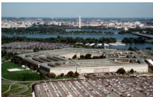
The Pentagon, headquarters of the U.S. Defense Department, as viewed with the Potomac River and Washington, D.C., in the background.