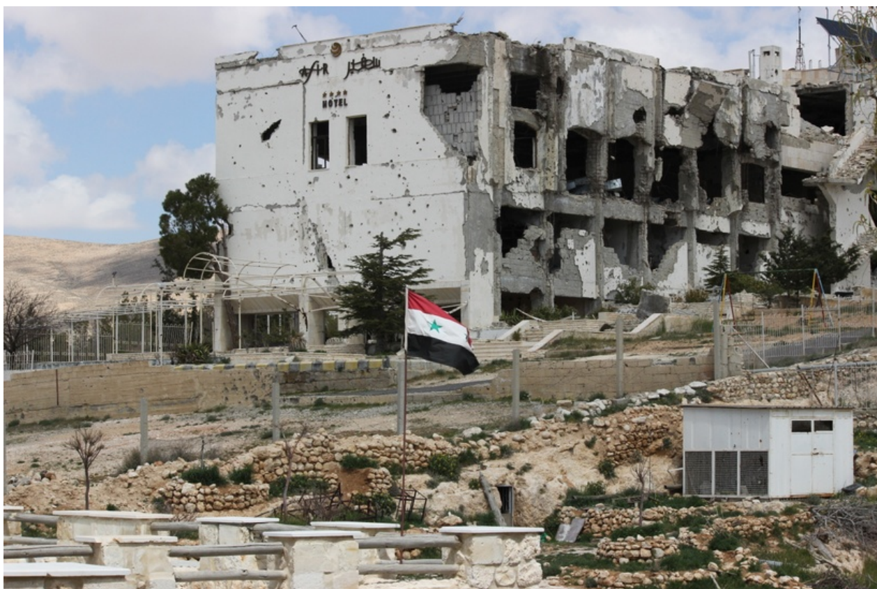
Safir Hotel

According to locals - the fighters included people from the Free Syrian Army, the Al Farouq Brigades, Ahfad al Rasul, Jabhat al Nusra, Jaish al Islam, Ahrar al Sham, Jabhat Islammiya, Palestinian Hamas fighters (Jabhat Tahreer al-Qalamoun), and Jabhat al Ruhr Qalomoun. Amongst them were fighters from Libya, Tunisia, Afghanistan, Chechnya, and Uyghur Turkic Chinese as well as Syrians.