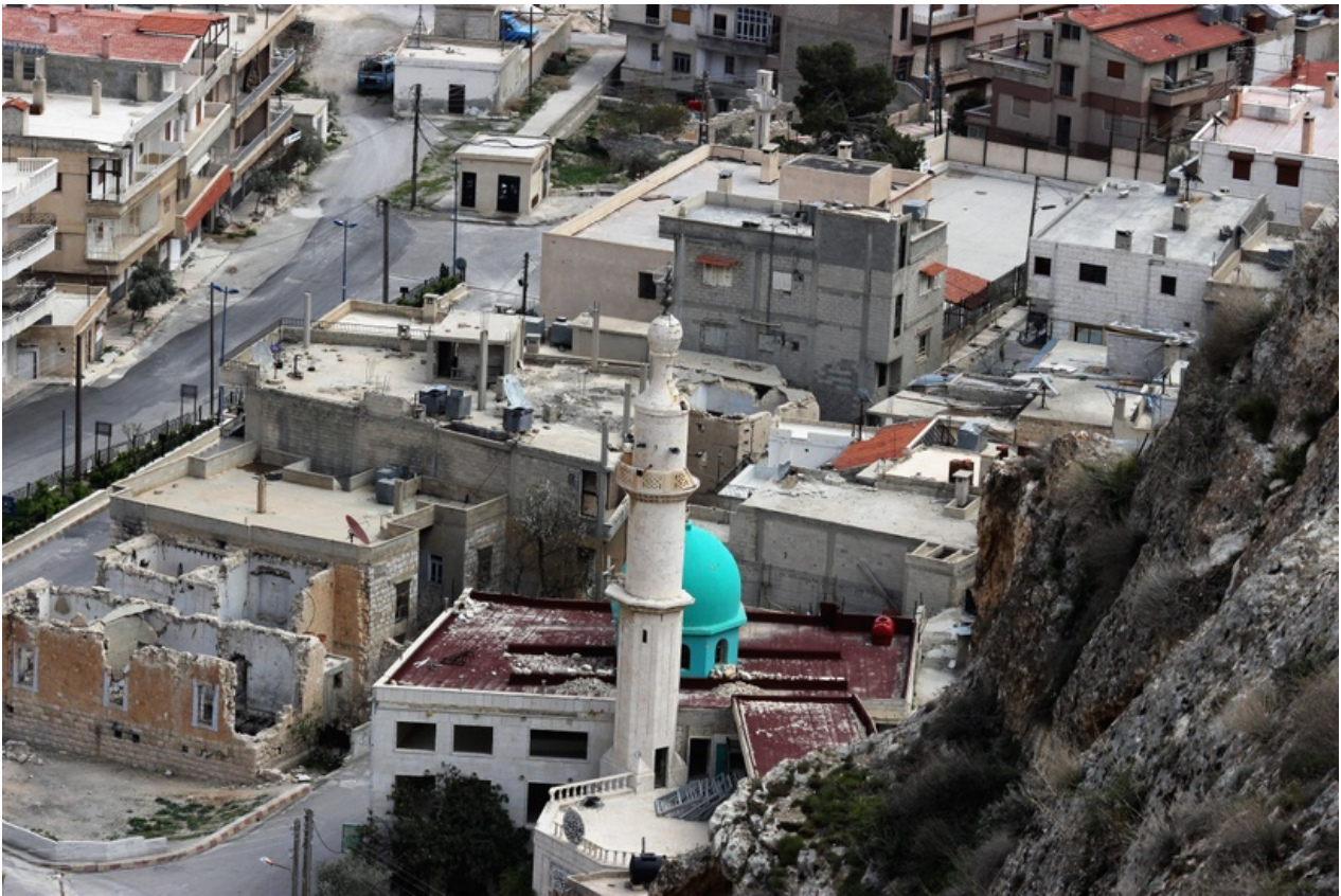
View from the mountain of Maaloula.

The terrorists proceeded to take up positions in the hotel and mountainous ridges that overshadowed Maaloula and they were able to snipe residents as they came into the open to collect water or food. Icons were burned and destroyed, including the statue of the Virgin Mary that had always overlooked the town. The terrorist factions would fill tyres with flammable material and roll them down onto the roofs of civilian homes below them.