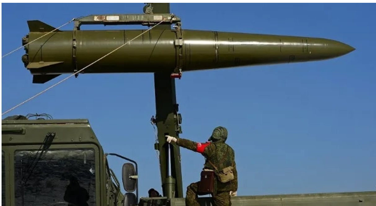
Russia’s Iskander-M (© Sputnik / Sergey Orlov / Go to the mediabank)

Altogether, Russia has well over 4,500 warheads ready for both strategic and battlefield use. However, it also has upwards of 1,500 thermonuclear warheads awaiting dismantlement, but which could be returned to service due to NATO aggression and be installed on land-based ICBMs, IRBMs (intermediate-range ballistic missiles), SLBMs, ALCMs (air-launched cruise missiles), etc.