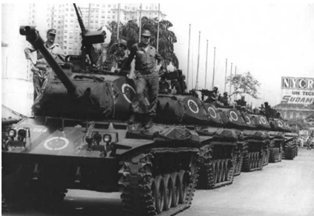
A column of tanks in a show of power along the streets of Rio de Janeiro in April 1968, during the

But at that time, the Amazon, the alleged “land without people” was inhabited by many thousands of Indigenous and traditional inhabitants, who were shoved aside, uprooted, and even killed when they resisted resettlement by the military.