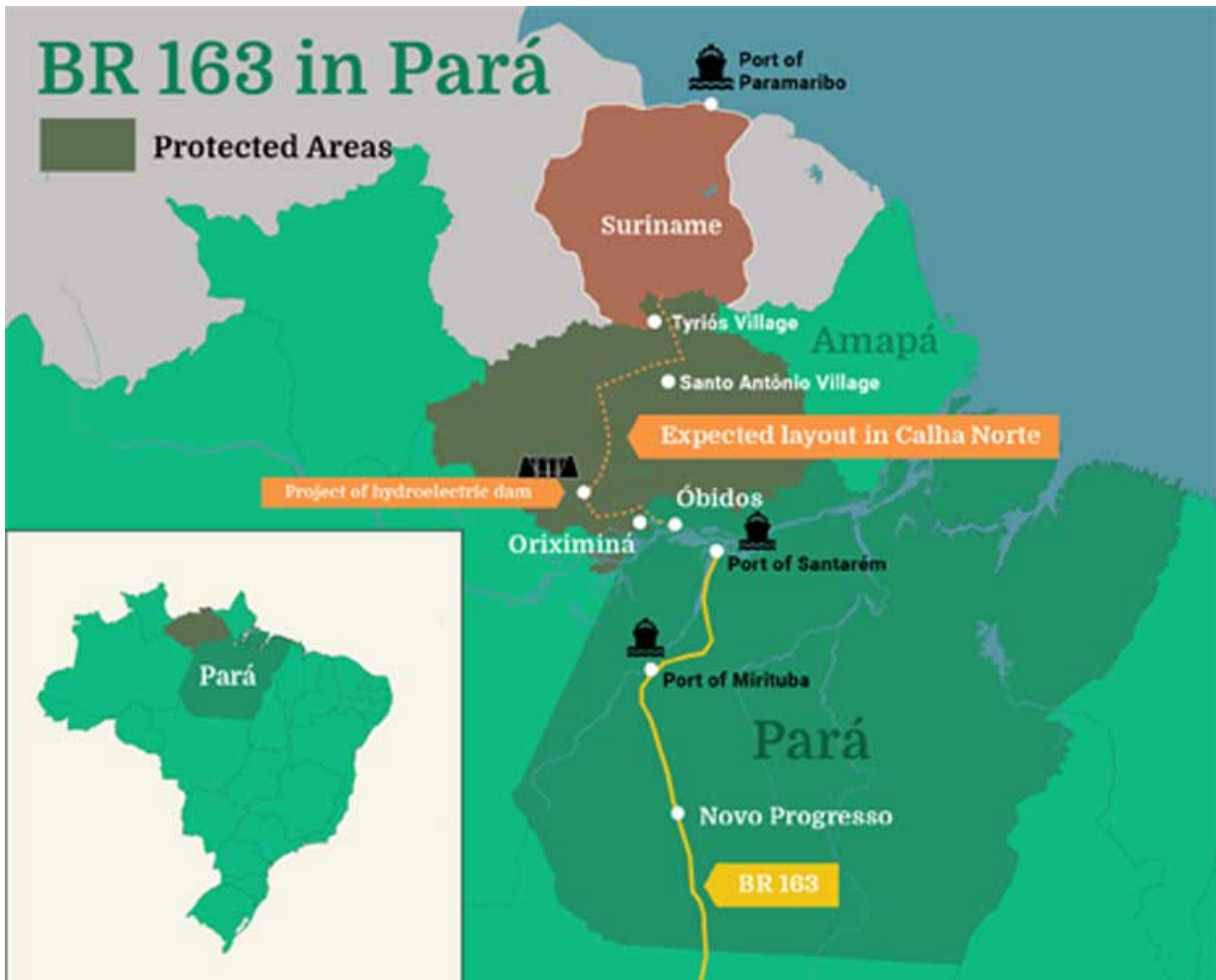
The plan to extend the BR-163 highway to the border with Suriname was originally drawn up by the Brazilian military dictatorship in the 1970s and has since been revived by President Jair Bolsonaro.