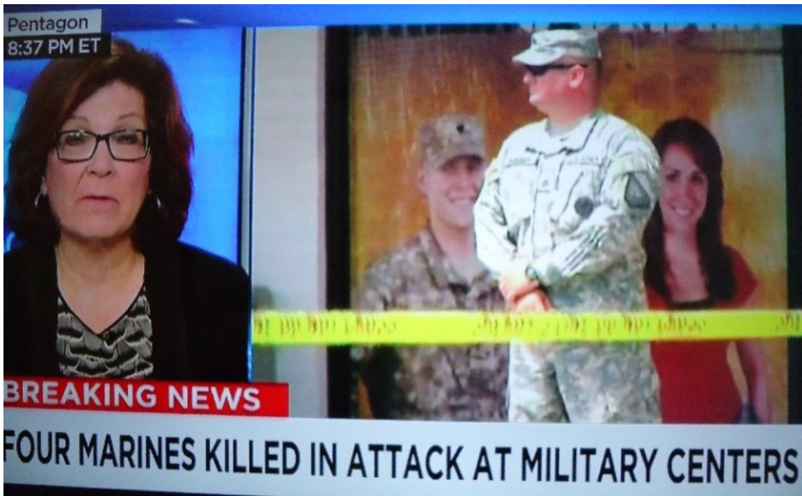
IMAGE: CNN's coverage of the incident featured this image, displayed on constant rotation, of a soldier appearing to stand guard in front of the strip mall Marine Recruitment shop in Chattanooga.