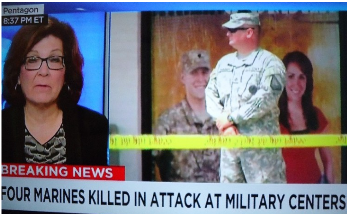
IMAGE: CNN's coverage of the incident featured this image, displayed on constant rotation, of a soldier appearing to stand guard in front of the strip mall Marine Recruitment shop in Chattanooga.