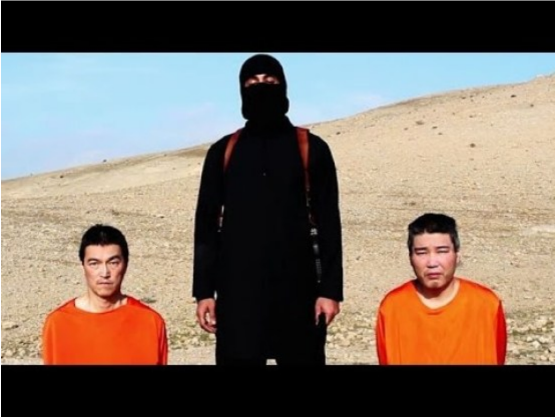
IMAGE: One of the many faked 'green screen' ISIS beheading videos, featuring Japanese hostages, and promoted as "authentic" by the S.I.T.E. Intelligence Group.