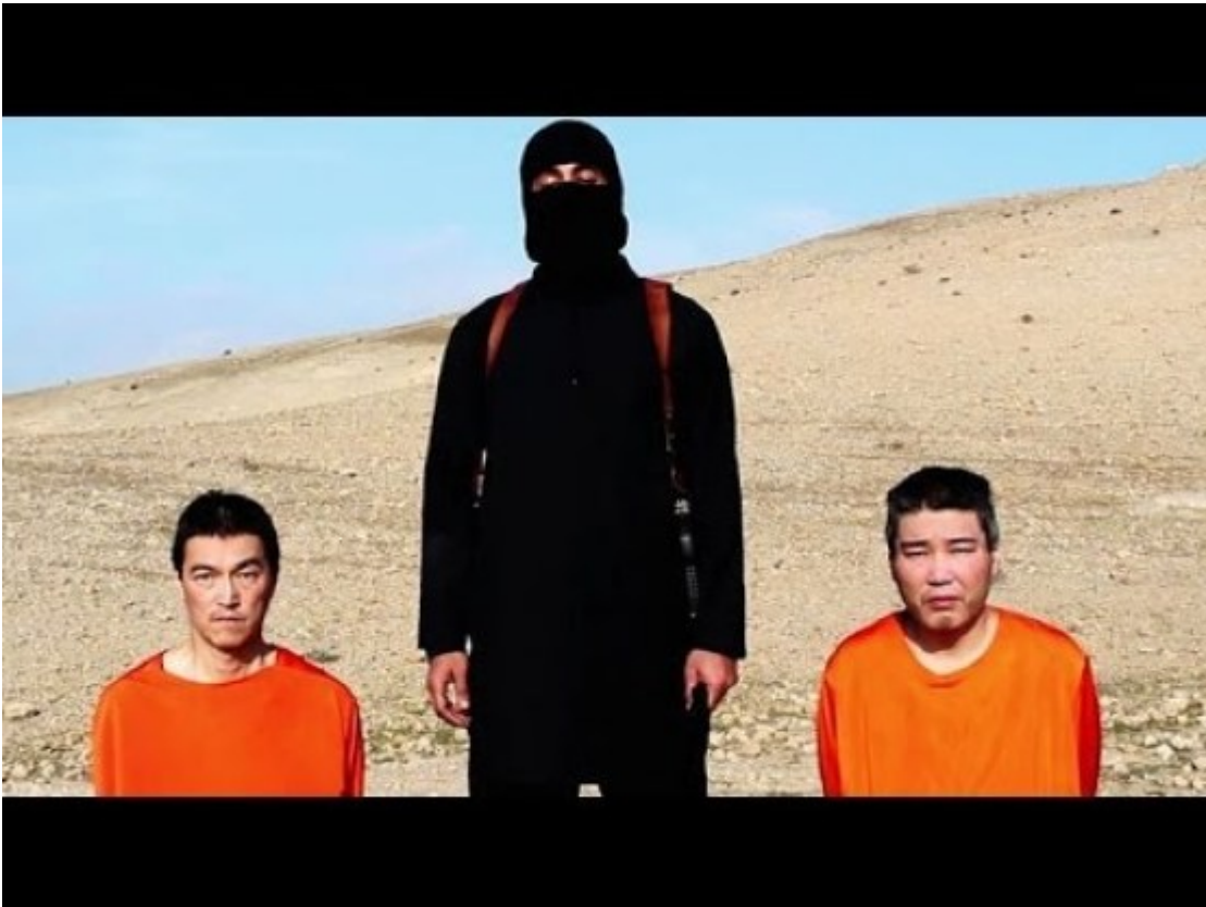
IMAGE: One of the many faked 'green screen' ISIS beheading videos, featuring Japanese hostages, and promoted as "authentic" by the S.I.T.E. Intelligence Group.