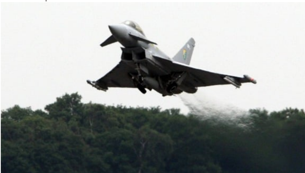
Typhoon fighter Jet