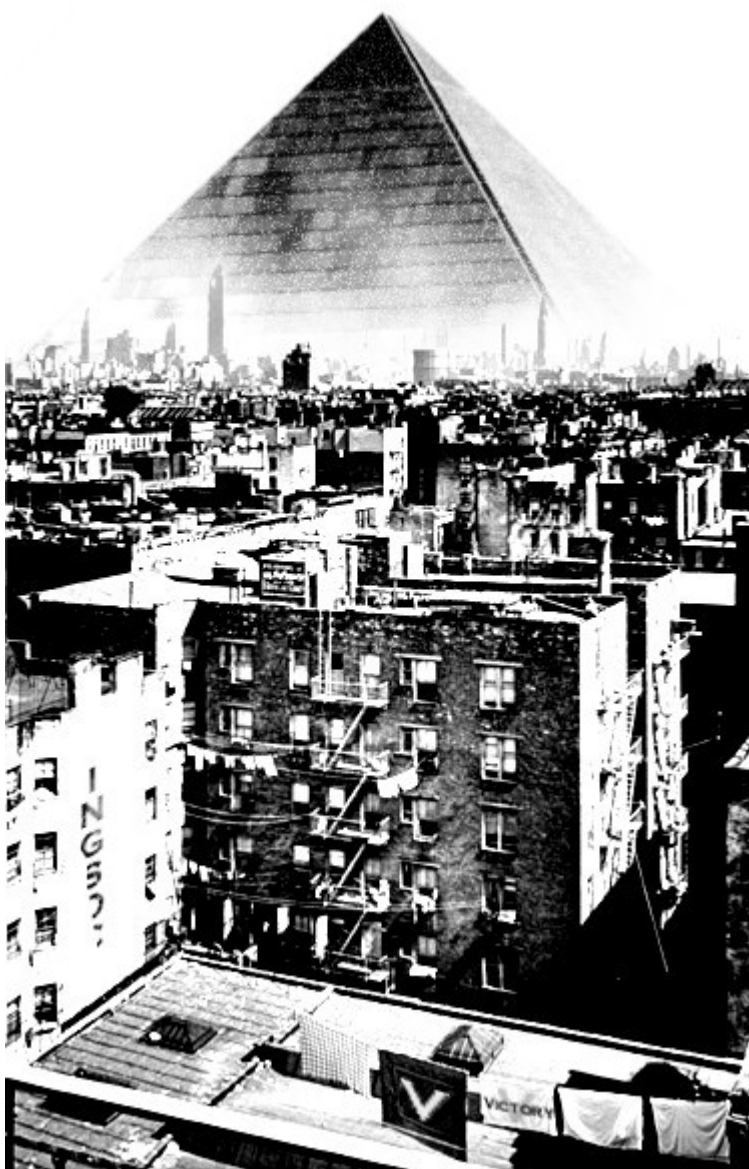
The Ministry of Truth rising over the slums of Airstrip One.

become the capital of Airstrip One, a province of the American super-state, Oceania. The impoverished majority of the populace, the “proles”, had to content themselves with seedy pubs and the faint hope of winning a weekly lottery, while the “inner circle” lorded over the masses. The proles were kept in their place of servitude by emergency powers and a permanent state of war. There is also more than a suspicion in Orwell’s 1984 that the supposed state of war and incoming attacks from anonymous enemies were a contrivance by the elite to instill fear in the masses.