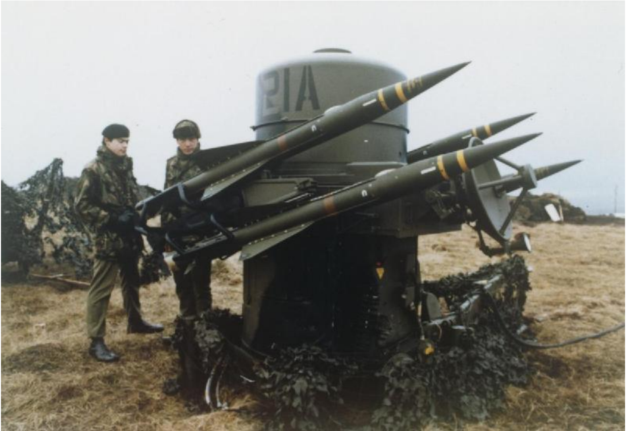
Rapier SAM Battery to be installed on residential apartment blocks in London's East End

The mainly working-class local communities objected to the militarization of their neighbourhoods. They also questioned the safety for residents in the event of the weapons being used to bring down aircraft suspected of carrying out terror attacks. One local man said: "What's going to happen if our houses get showered with debris?"