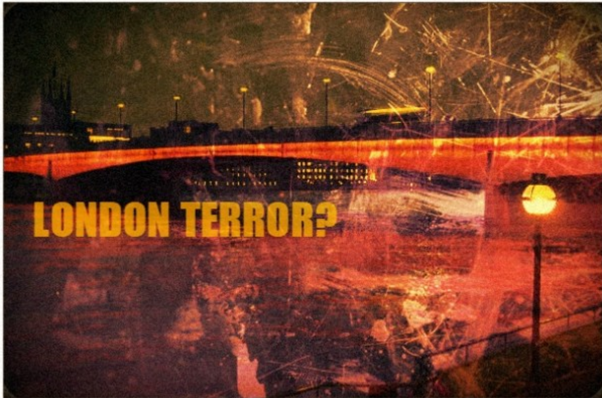
'LONDON TERROR' - What's truly behind this latest terror tragedy? (Photo Illustration 21WIRE's Shawn Helton)

The new London attacks, come on the heels of the UK's 2017 general election on June 8th, a race which has tightened dramatically since the Manchester Arena attack. Reuters reports the latest election details in the aftermath of yet another terror incident: