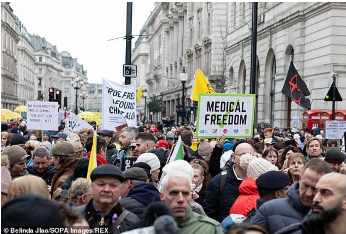
Protestors seen holding placards that say ‘medical freedom’ during a demonstration against vaccine mandates in the UK

‘The protocols of the RKI crisis team, some of which have now been released, raise considerable doubts as to whether the political measures to deal with the corona pandemic were really taken on a scientific basis.’