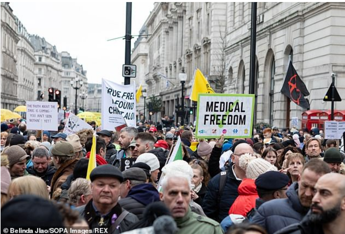
Protestors seen holding placards that say 'medical freedom' during a demonstration against vaccine mandates in the UK

‘The protocols of the RKI crisis team, some of which have now been released, raise considerable doubts as to whether the political measures to deal with the corona pandemic were really taken on a scientific basis.’