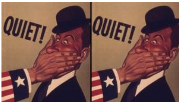
Image: A US government propaganda poster from the 1940s

“Western values” are constantly invoked, but what are these values? They are not the values that made the West what it is, or rather was. These values are rejected. Free speech is out if it challenges official explanations whether the government’s or the left’s or uses any words that can be misrepresented as “hate speech.” Democracy is out as demonstrated by the anti-democratic formation of the European Union. Truth is out as it is “offensive.” Rational inquiry is regarded as denial of emotion-based proclamations. It goes on and on. Diana Johnstone notes that government repression is most significant not against violent acts of rebellion but against Julian Assange for exercising press freedom to convey information to the public.