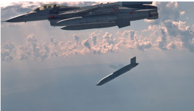
Image: USAF F-16 drops a Joint Air Surface Standoff (JASSM) missile

If Russia opted to retaliate against NATO targets, then the US would have to make a decision—continue to climb the escalation ladder, matching Russia punch for punch until one side became exhausted, or preemptively using nuclear weapons as a means of escalating to de-escalate—launch a limited nuclear strike using low-yield nuclear weapons in hopes that Russia would back down out of fear of what would come next—a general nuclear war.