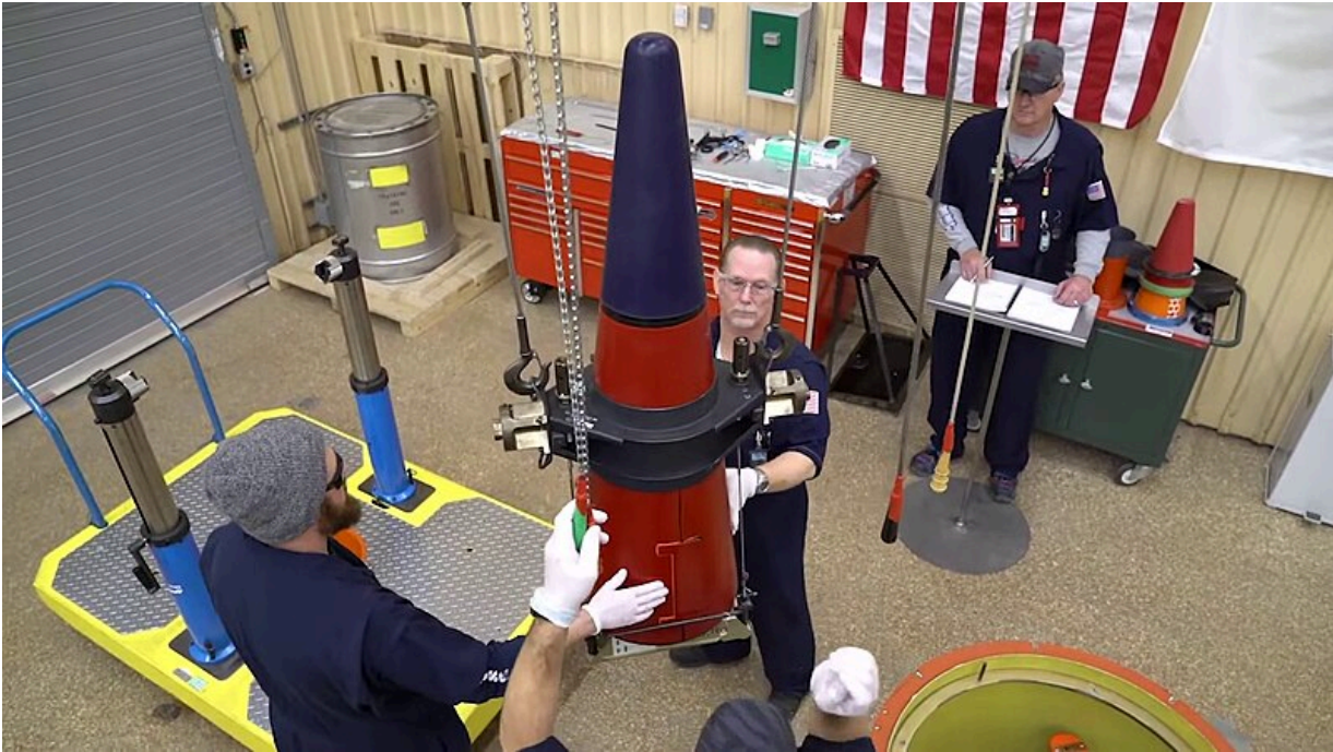
Screenshot of a National Nuclear Security Administration video showing the casing of a W76-1

Return, for a moment, to the scenario-driven employment of the W-76-2 low yield nuclear weapon as part of the “escalate to de-escalate” strategy that underpins the entire reason for the W-76-2 weapon to exist in the first place.