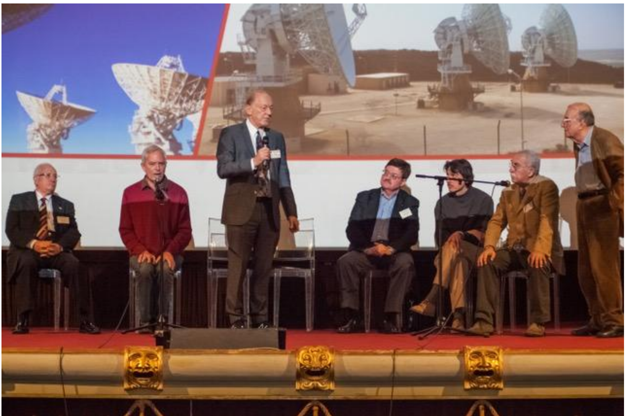
Video: 70 Years of NATO; The Historical Significance. (Florence, April 7, 2019)