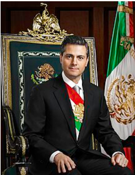
Mexican President Enrique Peña Nieto

It's also about political and economic war on Russia, Cold War 2.0, risking things turning hot, the most dangerous time in memory, neocons infesting Washington playing with fire, media reports throwing fuel on it.