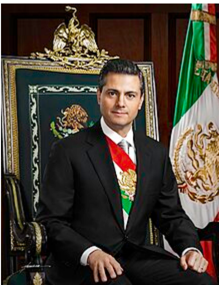
Mexican President Enrique Peña Nieto

It's also about political and economic war on Russia, Cold War 2.0, risking things turning hot, the most dangerous time in memory, neocons infesting Washington playing with fire, media reports throwing fuel on it.