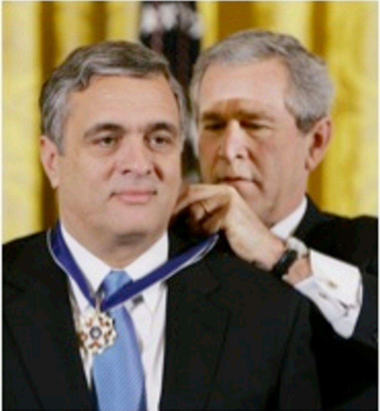
President Bush awarding National Medal of Honor to George Tenet, Dec. 14, 200