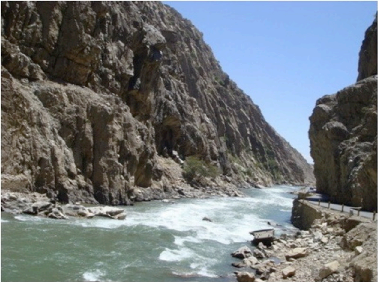
Panjashir valley, area of Northern Alliance dominance