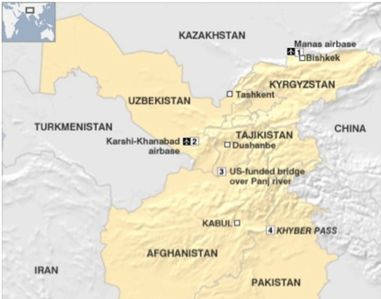
Map showing US bases including Karshi-Khanabad

A third anomaly is that the Terror War led to a dramatic increase in the resort to terror, and even torture, by America itself, including against its own citizens. In this context it is relevant that Cheney and Rumsfeld, through their participation in the Defense Department's super-secret Doomsday Project, had also been part of Continuity of Government (COG) planning for undermining the U.S. Bill of Rights by the warrantless surveillance and detention of dissenters. 26 These plans, dating back to the fear of Communists in the McCarthyite 1950s, have been the underpinnings for the elaborate plans in the Pentagon and elsewhere for dealing with antiwar protests against the Pentagon's plans for global domination.