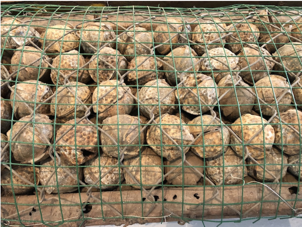
US cluster bombs in Laos

“More bombs were dropped on Laos between 1965 and 1973 than the U.S. dropped on Japan and Germany during WWII. More than 350,000 people were killed. The war in Laos was a secret only from the American people and Congress.”