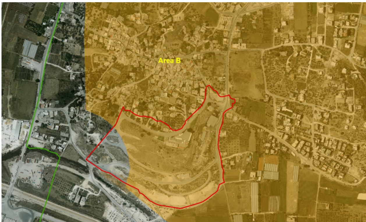
117 dunams of territory allocated for an industrial area in the community of Irtah – most of it is in Area B

Despite the full Israeli responsibility, almost no public land has been allocated for Palestinian use: of the 866 dunams allocated before 1995, 669 dunams were allocated as aforesaid for the purpose of establishing the settlements; And of the remaining 197 dunams, at least 121 dunams are currently located in Area B, which is under Palestinian control anyway.