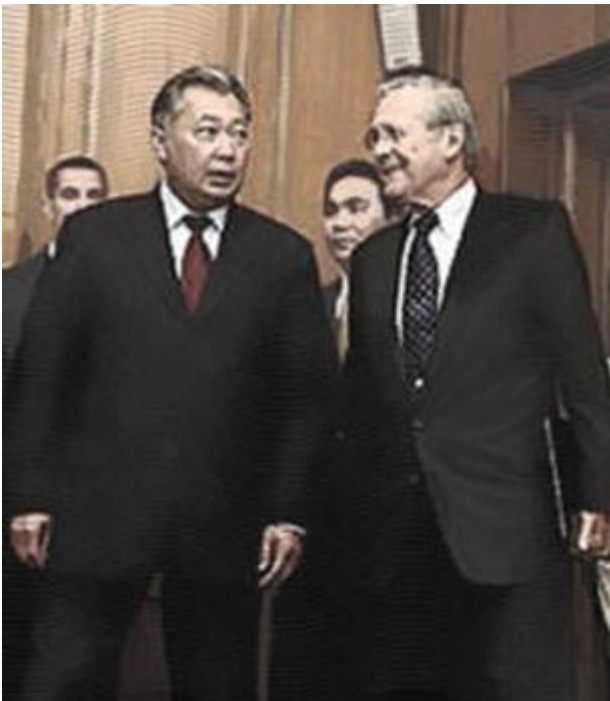
Bakiyev and Rumsfeld