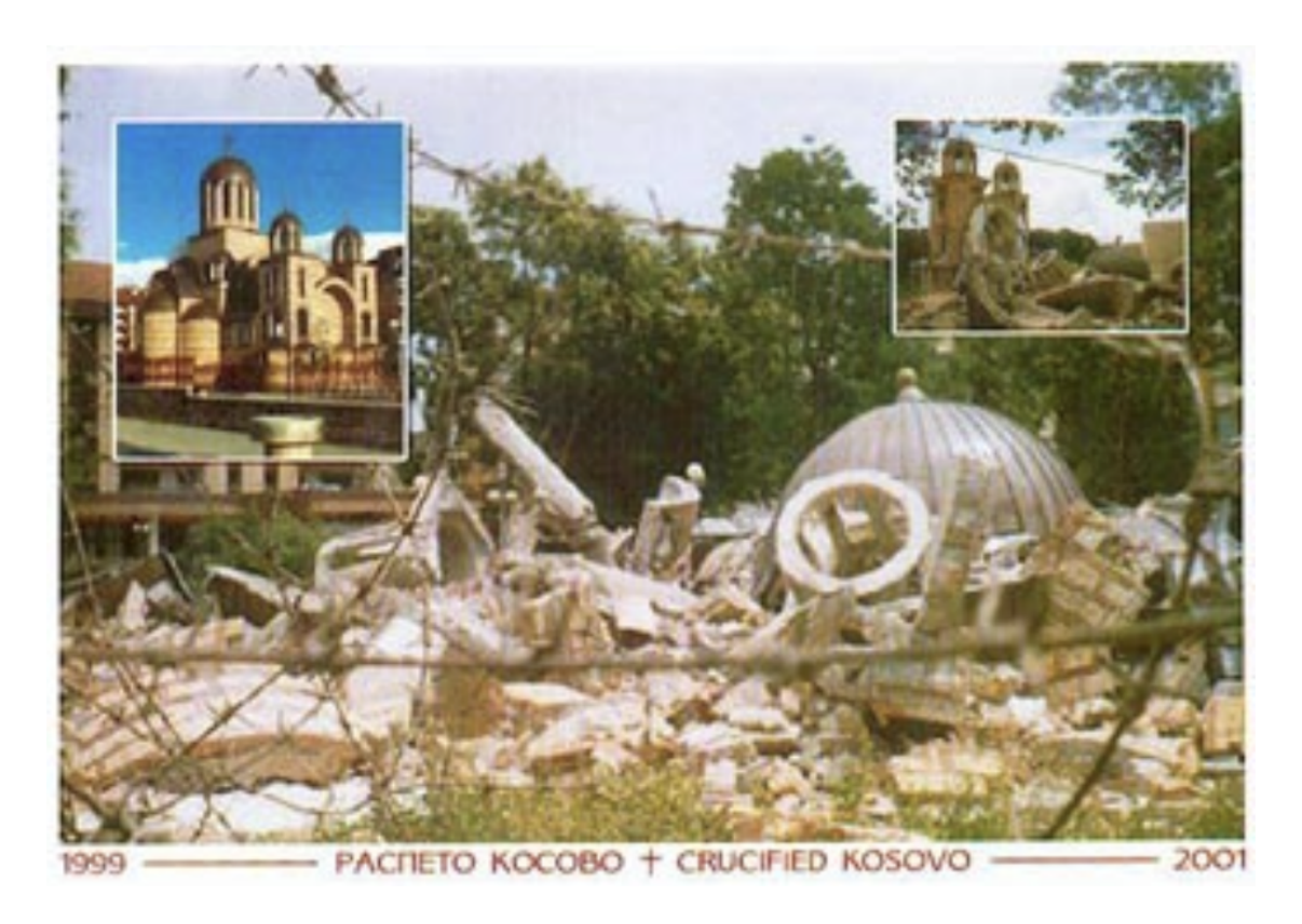
Crucified Christian (Serb Orthodox) Kosovo after the war by the KLA's members in power