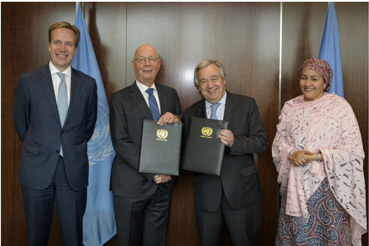
Børge Brende & Klaus Schwab (WEF) and António Guterres & Amina Mohammed (UN)

This also shows that the WEF and the UN have been working closely for several years before their partnership became official in June 2019.