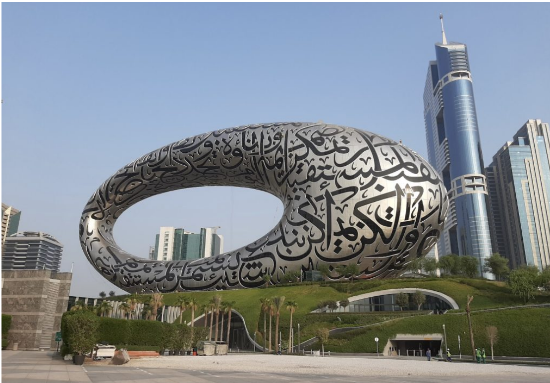
Museum of the Future, Dubai

In October 2022, the Dubai Future Forum conference was organised for the first time in the Museum of the Future . Behind the initiative is the Dubai Future Foundation , which is led by Crown Prince Sheikh Hamdan bin Mohammed bin Rashid Al Maktoum (YGL 2008) and which also includes the leading Troika from the World Government Summit. In cooperation with World Economic Forum, the Dubai Future Foundation is also managing the local Center for the Fourth Industrial Revolution in United Arab Emirates . [10]