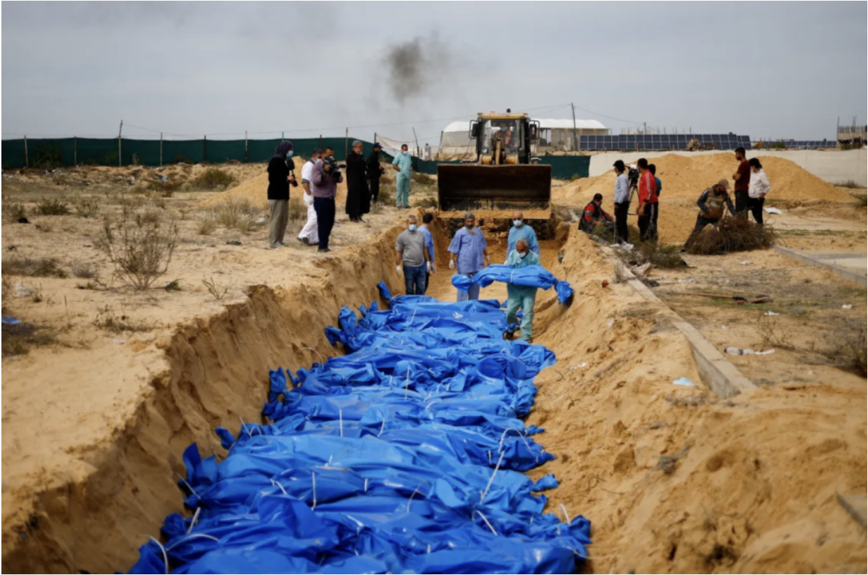
The bodies of Palestinians killed in Israeli strikes are buried in a mass grave in Khan Younis.

The report is based on interviews with six Israeli intelligence officers who have worked with these systems. As one of the officers explained to +972, by adding a name from a Lavender-generated list to the Where's Daddy home tracking system, he can place the man's home under constant drone surveillance, and an airstrike will be launched once he comes home.