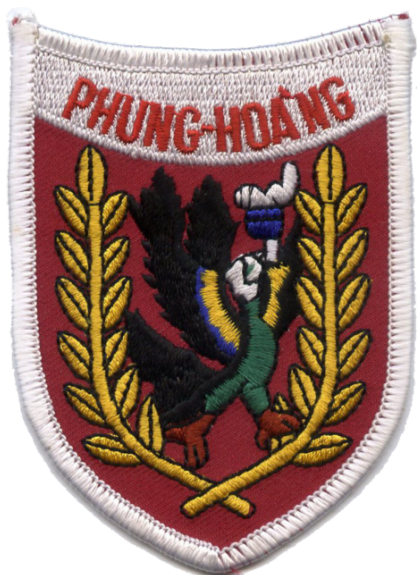
Image: Patch worn by Phoenix Program operatives.

Just as U.S. weapons development aims to be at the cutting edge, or the killing edge, of new technology, the CIA and U.S. military intelligence have always tried to use the latest data processing technology to identify and kill their enemies.