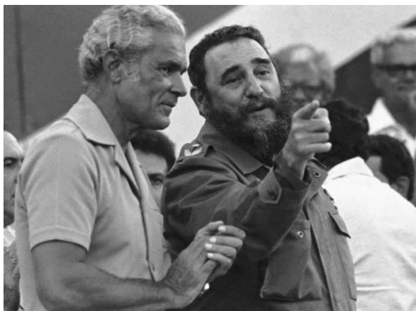
Image: Michael Manley, left, with Fidel Castro in 1977.

The rogues list includes: Augusto Pinochet of Chile; Anastasio Somoza Debayle of Nicaragua; Carlos Castillo Armas of Guatemala; the Shah of Iran; and, more recently, Paul Kagame of Rwanda and Yoweri Museveni of Uganda.