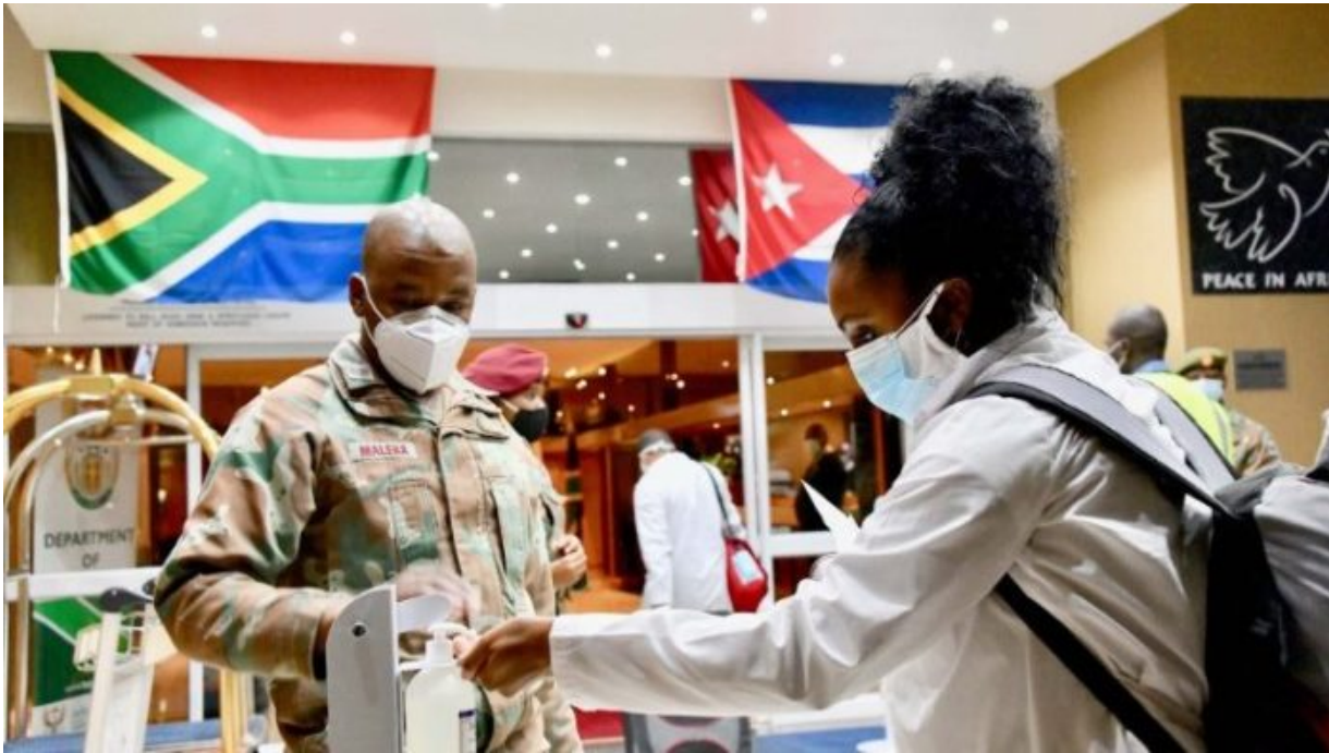
Cuban doctors working with their South African counterparts to combat the coronavirus.

These internationalist gestures Cuba has done at great national and personal cost, including the loss of lives on battlefields alongside compatriots fighting apartheid and colonialism in Southern Africa. Cuba's technical experts contributed to the upgrading of the Maurice Bishop International Airport (formerly Point Salines Airport) in Grenada; they facilitated the design and building of micro-dams for irrigation during the drought season and, the construction of the José Martí Technical High School in Jamaica.