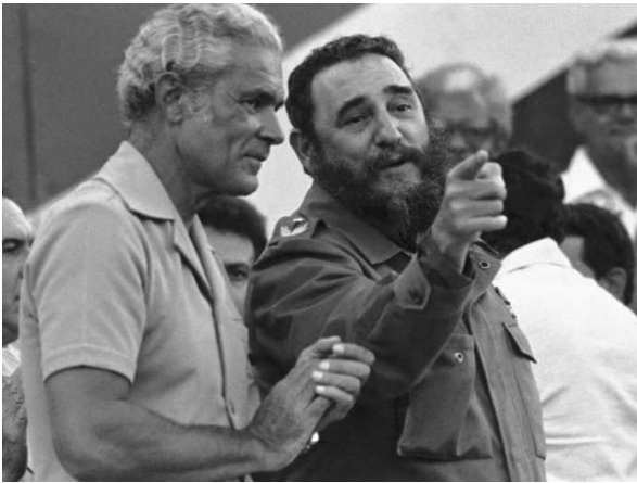
Image: Michael Manley, left, with Fidel Castro in 1977.

The rogues list includes: Augusto Pinochet of Chile; Anastasio Somoza Debayle of Nicaragua; Carlos Castillo Armas of Guatemala; the Shah of Iran; and, more recently, Paul Kagame of Rwanda and Yoweri Museveni of Uganda.