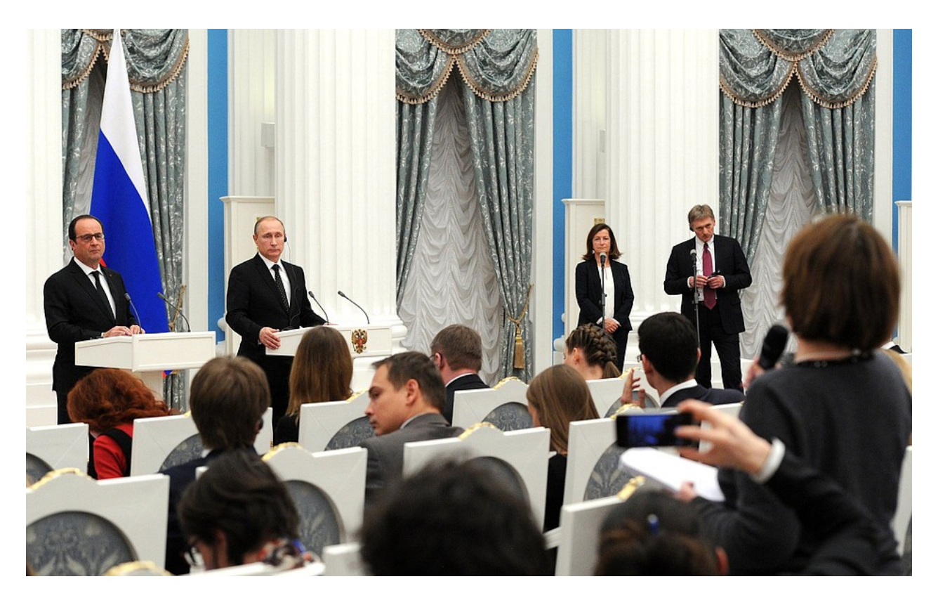
Press statements and answers to journalists' questions following meeting with President of France Francois Hollande.

After all, our planes, flying at a height of five to six thousand metres, were absolutely unprotected; they were not protected against possible attacks by fighter jets. If we had even thought this might be possible, then first of all, we would have long ago established systems there to protect our planes against possible attacks.