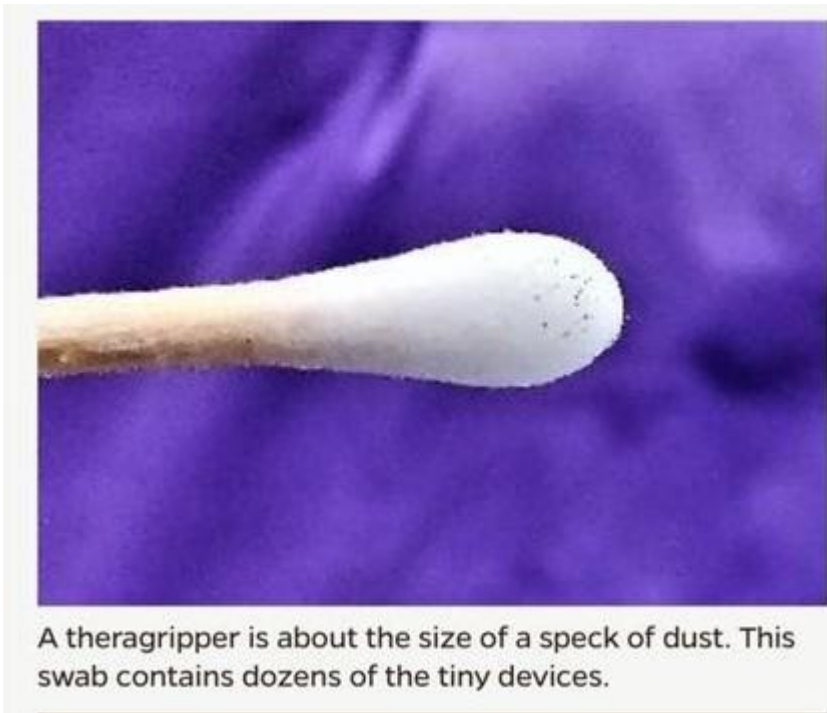
Figure 2: Theragrippers on a cotton swab

The Johns Hopkins University research team published positive results from an animal study as a cover article in Science Advances on October 28, 2020 [5], confirming that the new technology works flawlessly: