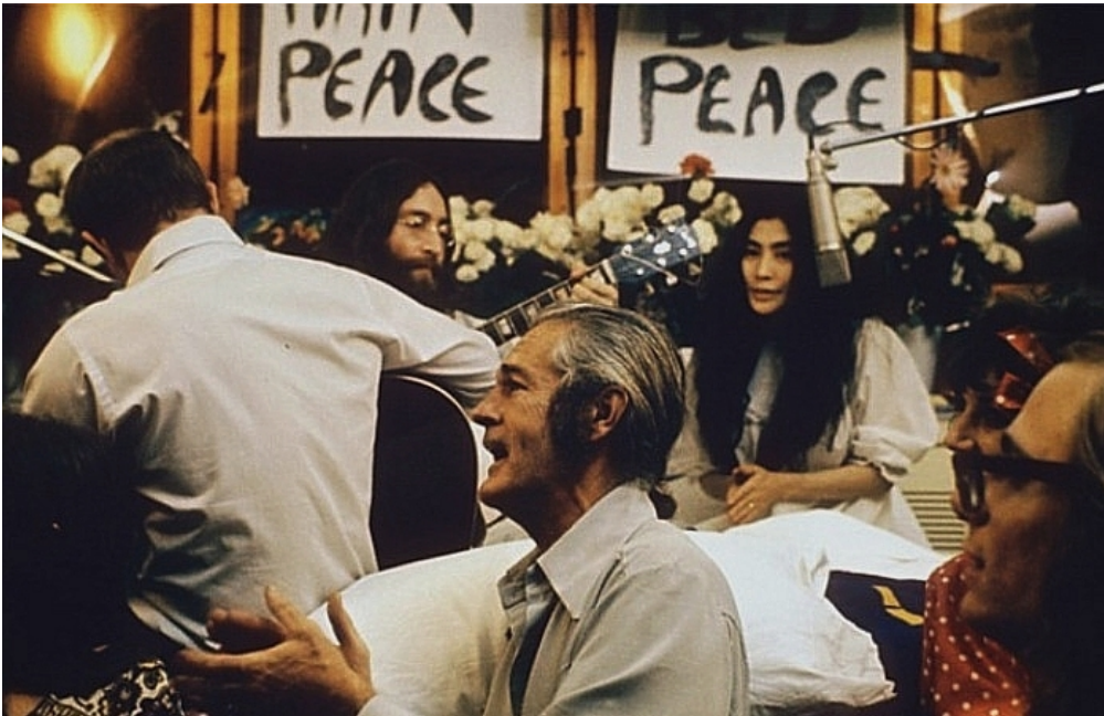
Recording “Give Peace a Chance” during the Bed-In for Peace at the Queen Elizabeth Hotel, Montreal

by FBI agents suggesting that he either commit suicide or the details of his private life would be revealed to the public. The FBI kept up its pursuit of King until he was felled by a hollow-point bullet to the head in 1968.