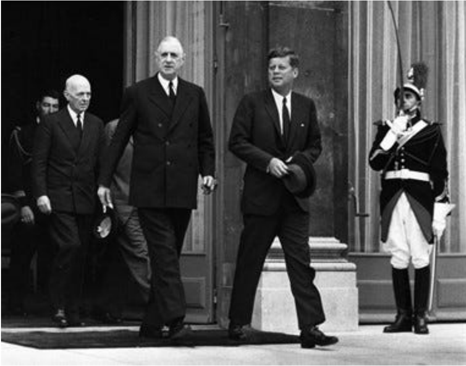
JFK and de Gaulle at the Champs Elysee in 1961

De Gaulle was not only successful at taking France out of the NATO cage in 1966[4], but he had organized to ensure Algeria's independence against the will of the entire deep state of France who often worked with Dulles' State Department to preserve France's colonial possessions.