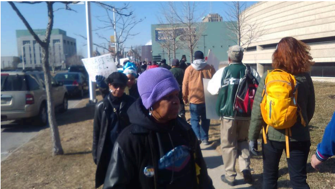
Detroit demonstration against Jefferson slavery exhibit on March 12, 2019

Many accounts of Jefferson’s life extol his mastery of law, architecture, mathematics, agriculture and other professional fields. He signed the documents outlawing the importation of enslaved Africans into the U.S. in 1807, although the system continued long after his death and only ended with the Civil War fought during 1861-1865. As early as 1788 he was said to have banned the importation of enslaved Africans into the state of Virginia.