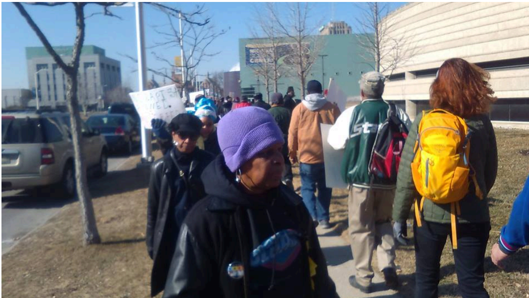
Detroit demonstration against Jefferson slavery exhibit on March 12, 2019

Many accounts of Jefferson’s life extol his mastery of law, architecture, mathematics, agriculture and other professional fields. He signed the documents outlawing the importation of enslaved Africans into the U.S. in 1807, although the system continued long after his death and only ended with the Civil War fought during 1861-1865. As early as 1788 he was said to have banned the importation of enslaved Africans into the state of Virginia.