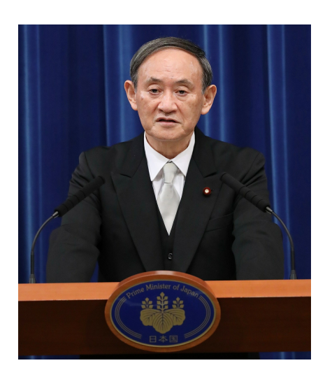
Image on the right: Japanese Prime Minister Yoshihide Suga giving his first press conference as Prime Minister on 16 September 2020.

If the Japanese are superior race, they should behave accordingly; they should be generous; they should be inclusive; they should understand other races; they should hold hands with other races and cooperate for a better world for all.