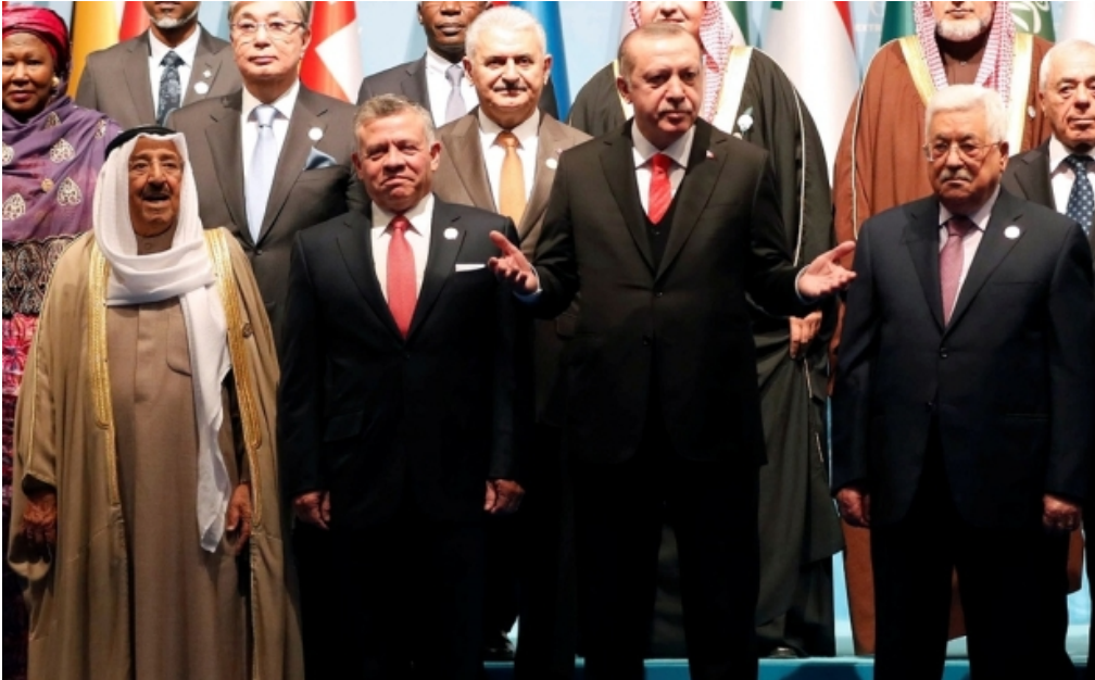
Erdogan, flanked by Kuwait's emir, Sabah, Abdullah of Jordan and Mahmoud Abbas of the Palestinian Authority, at the OIC conference

It also sidelined the conference which Saudi Crown Prince Mohammed bin Salman laid on for Donald Trump in Riyadh last May.