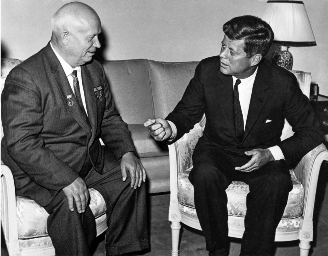
John F. Kennedy meeting with Nikita Khrushchev in Vienna.