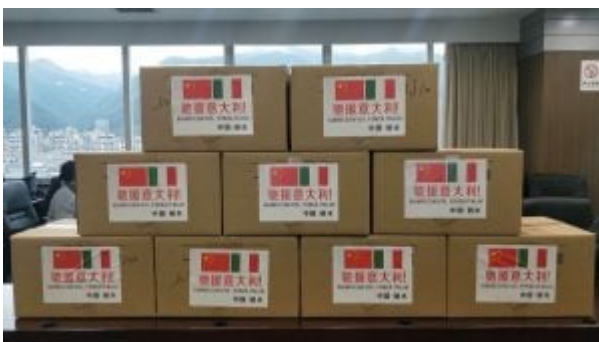
Image: March 1, 2020 shows medical supplies, including masks, gloves and protective suits, donated to Italy by Lishui City, east China’s Zhejiang Province.

The Italian government, public health officials and regional doctors proclaiming a “novel virus” had landed in Northern Italy, insisted that emergency preparations be activated to prepare for this “massive” increase in Covid-19 patients. That these forecasts were speculations, using linear model forecasts, coming from doctors with conflicts of interest