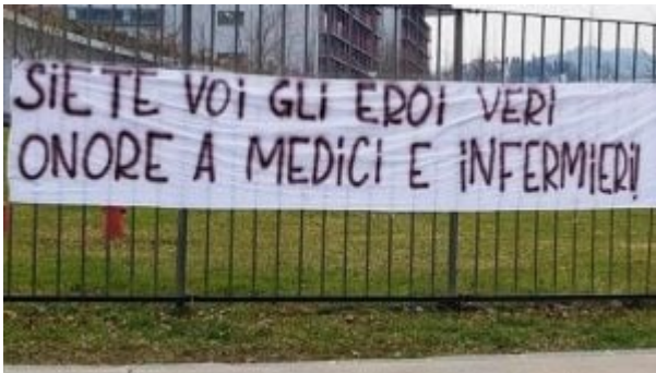
Image: At the entrance to the hospital, a sign reads: "You are the real heroes", Bergamo, Italy, March, 2020.

A brief timeline of the series of events as they unfolded in Northern Italy in Spring 2020: