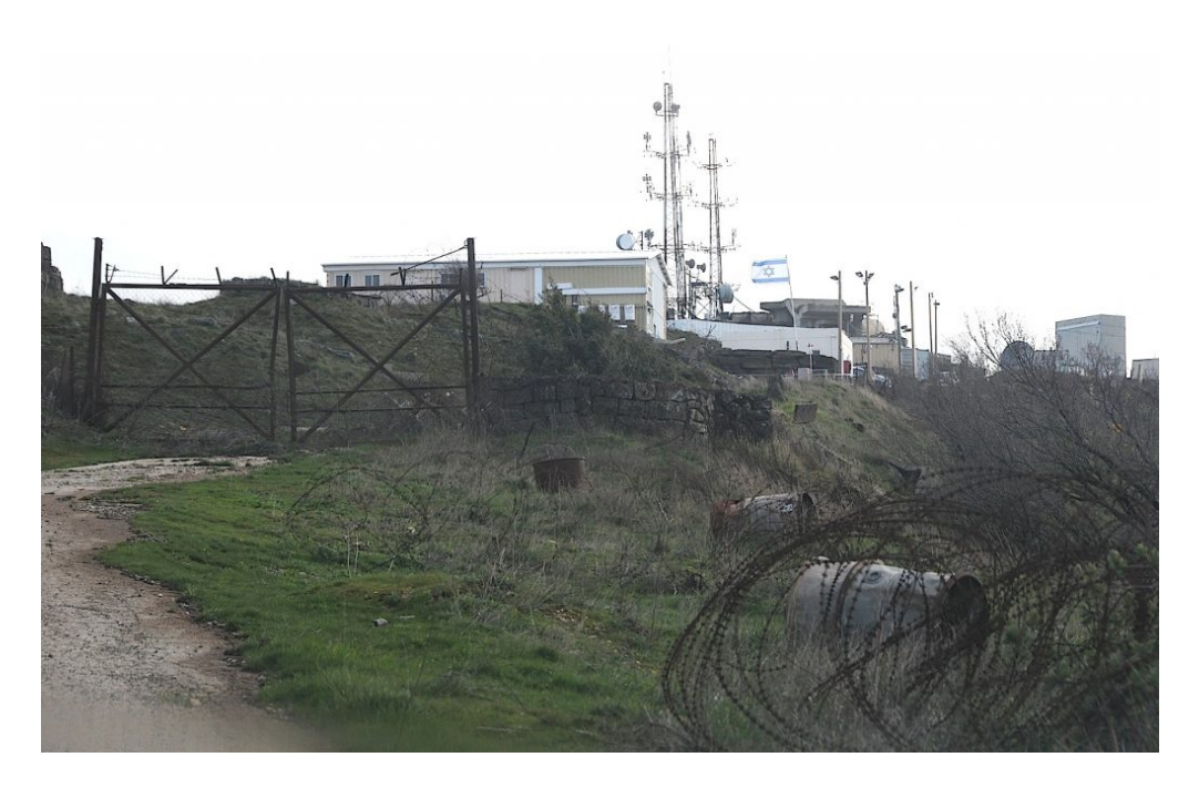
Spy - surveillance base on the hill overlooking Syria

But it is Israel which now has the right to 'worry' and to murder people in the name of its 'security'. That is precisely what the tone of the Western mainstream periodicals clearly suggests.