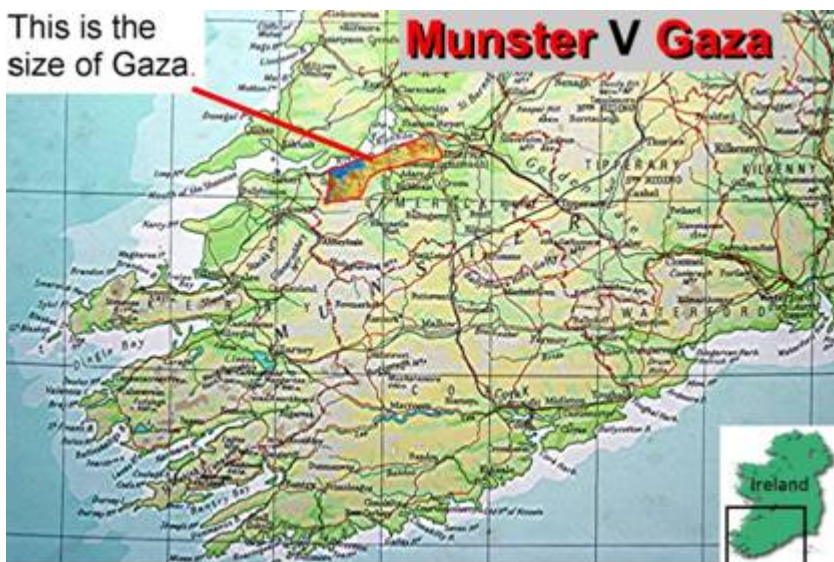
Figure 2. The tiny Gaza strip is home to 1.6 million people two thirds of them are refugees and their descendants forcibly expelled from their homes, farms and villages inside present-day Israel in order to allow Jewish immigrants seize their property and create an ethnically cleansed electorate for the establishment of a Jewish state.

Bates' argument that diamonds from any country accused of human rights violations could be classed as blood diamonds is a fallacious one. Unless revenue from diamonds is a significant source of funding for, or the cause of, human rights violations, as is the case in Israel and parts of Zimbabwe, then it would be difficult to make a credible case for classifying diamonds as blood diamonds.