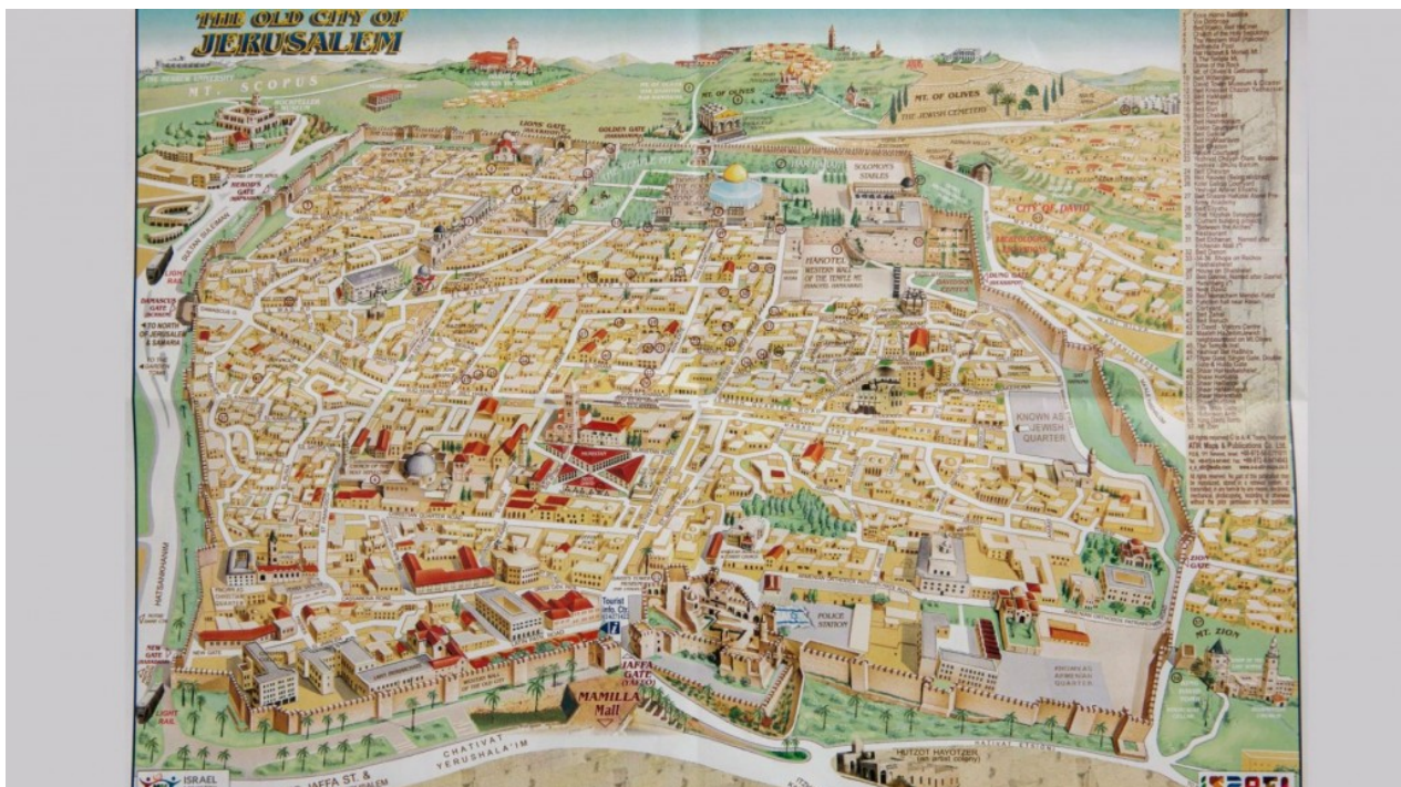
Tourist map of Jerusalem omitting key non-Jewish sites. Olivier Fitoussi

These are paltry and distorted offerings, given the nearly 1,000 years of Islamic rule over Jerusalem.