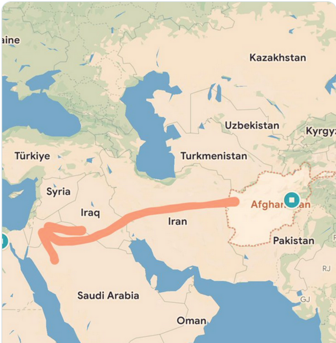
Tweet from an account purporting to belong to a Taliban spokesperson

The false report, which was even reported in the Jerusalem Post, was denied by a Taliban spokesperson on Saturday. The blue-tick account which posted it has now been suspended.