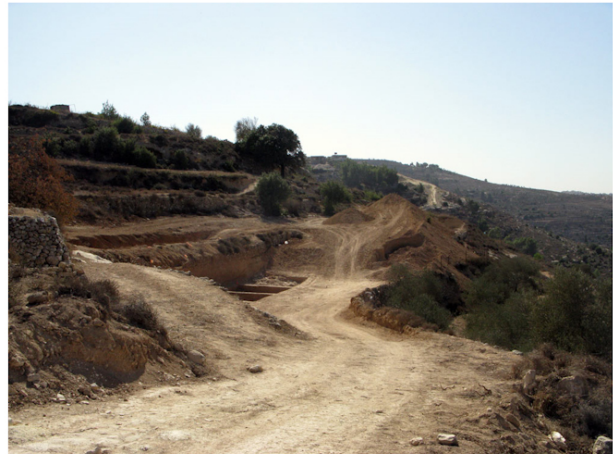
Ancient agricultural terraces in al-Walaja (left) and Israel's destruction of ancient terraces to build the wall (right).