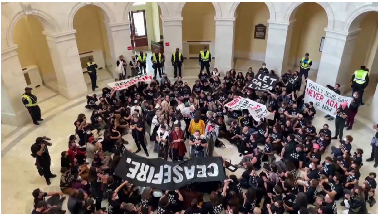
Jews demanding for ceasefire in The Capitol

Be it noted though that there are many thousands, maybe hundreds of thousands of Jews in Israel and around the world, who do not agree with this murderous onslaught demonstrated by their Israeli leadership against Gaza. Thousands of them protested over the past weekend in Jerusalem and capital cities around the world, against Netanyahu’s merciless war policies.