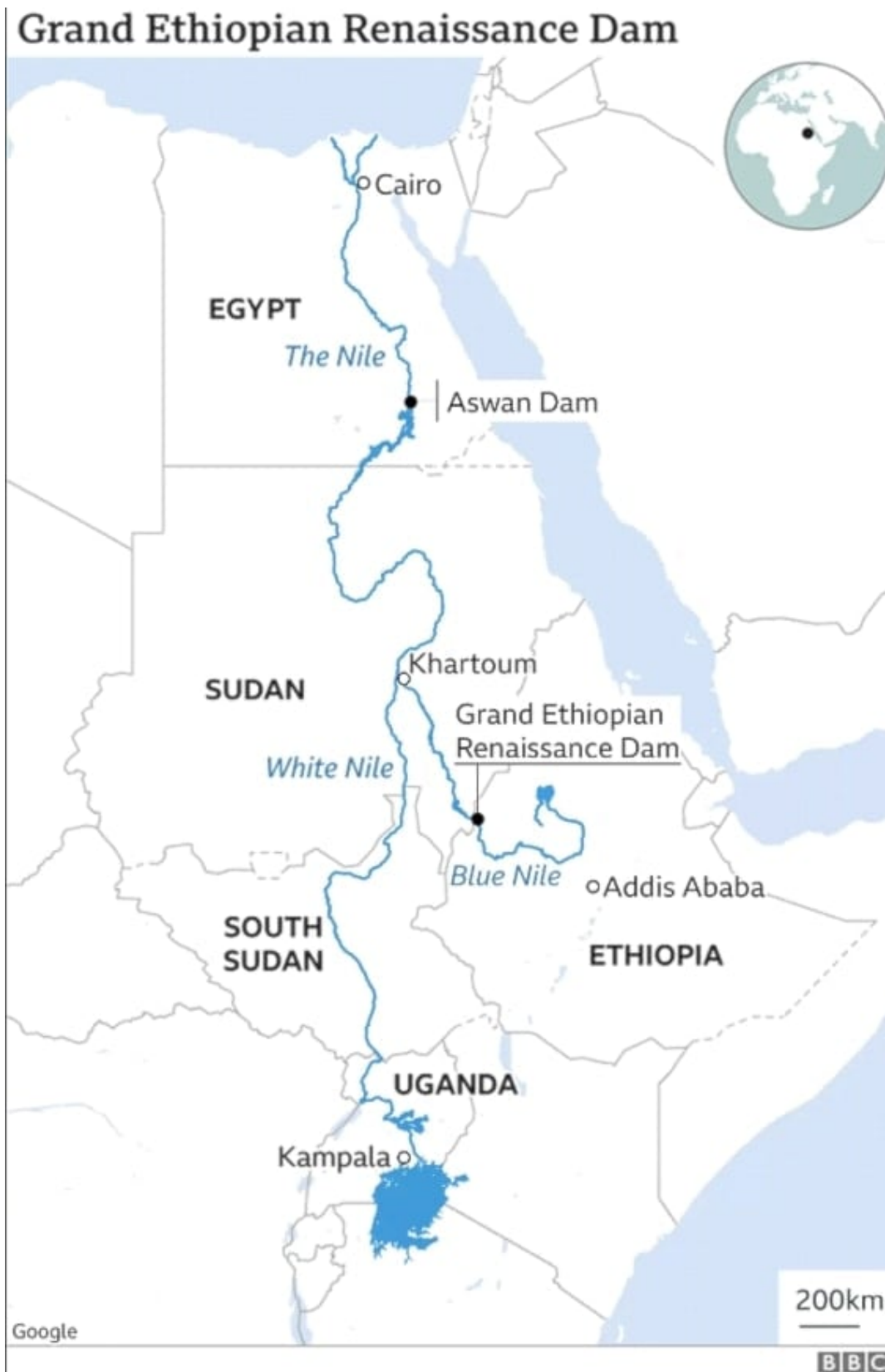
Ethiopia's Renaissance Dam, built in 2011

called Renaissance Dam in 2011, cutting much-needed water from the Nile to both Sudan and Egypt. It has caused a huge dispute ever since that has yet to be resolved.