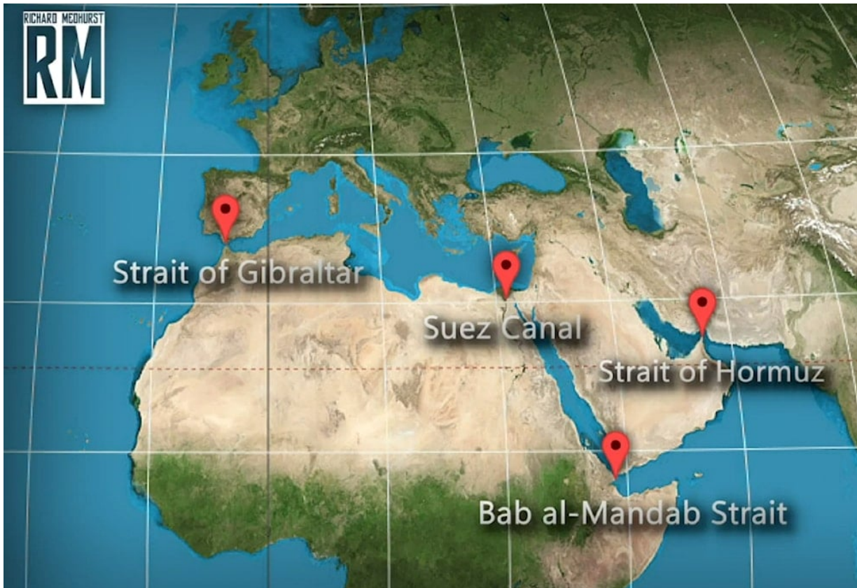
All vital straits are located in Arab countries

It is not only the size of the Arab world, but look at the straits: all the vital straits and shipping lanes are located in Arab countries: The strait of Gibraltar, (originally Jabal Ṭāriq), the Suez Canal, the Bab al-Mandob Strait, and the Strait of Hormuz between Iran and Oman.