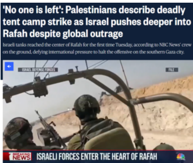
Image: By being embedded with Israeli forces, NBC ( 5/28/24 ) presented news literally from the IDF point of view.

The same sentence continued that Israel was “defying international pressure to halt an offensive that has sent nearly 1 million people fleeing Rafah.” But Israel was not just “defying...pressure”; it was in violation of a direct order from the International Court of Justice ICJ to halt its attack on Rafah. Yet NBC reporters rode into Rafah with an army that was ignoring international law to commit further genocide in Gaza.