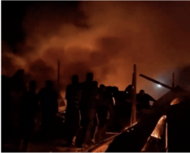
“When the Israeli bombs strafed the safe zone, the plastic tents caught fire, sending flames leaping two meters high, before the melting, blazing structures collapsed on the people inside, many of them children who’d just been tucked in for the evening.”

The world saw the terror of the massacre on international and social media. Images showed the area of the strike engulfed in flames as Palestinians screamed, cried, ran for safety and sought to help the injured. “They told people to move there then killed them,” Richard Medhurst ( 5/28/24 ) posted.