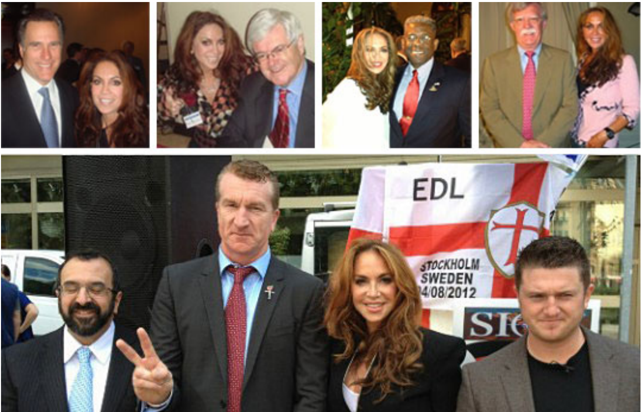
Image: Not only is America's Islamophobia subsidiary linked directly to US government representatives directly involved in both the arming, funding, and exploitation of terrorist groups and the various wars fought upon the pretext of "fighting terrorism," but this subsidiary interlocks with those across Europe including the UK's "English Defense League" and PEGIDA. The special interests characters like Bolton, pictured posing with Geller top, right, represent, have made literally trillions off of the wars predicated on the fear, hatred, and hysteria perpetuated by Islamophobia.