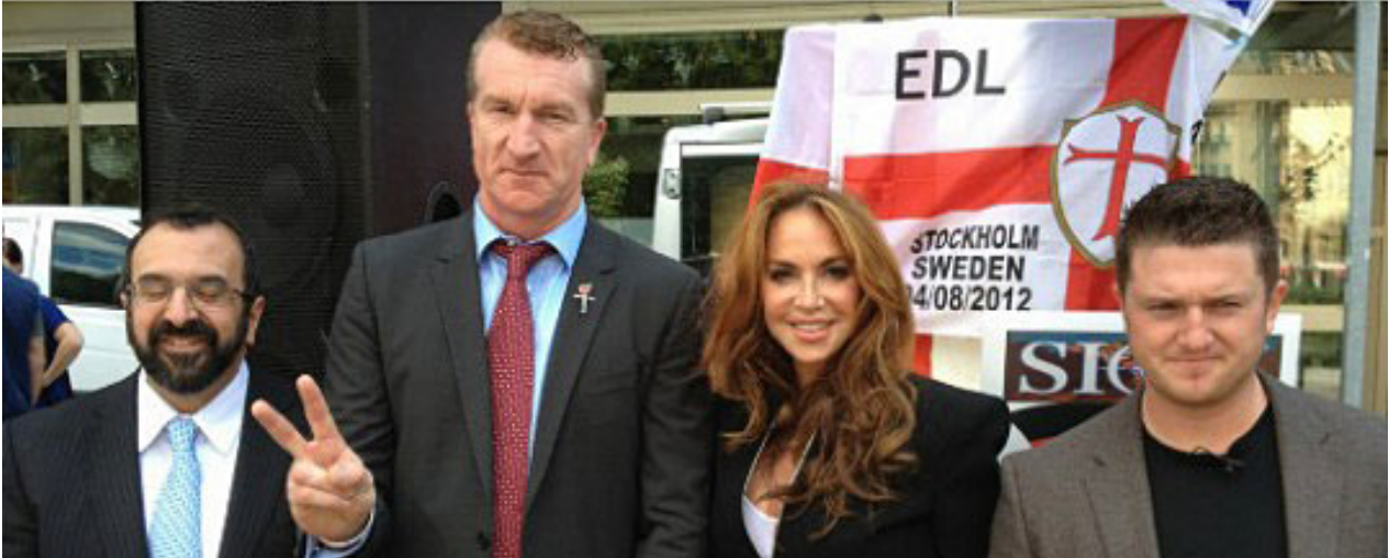
Image: Not only is America's Islamophobia subsidiary linked directly to US government representatives directly involved in both the arming, funding, and exploitation of terrorist groups and the various wars fought upon the pretext of "fighting terrorism," but this subsidiary interlocks with those across Europe including the UK's "English Defense League" and PEGIDA. The special interests characters like Bolton, pictured posing with Geller top, right, represent, have made literally trillions off of the wars predicated on the fear, hatred, and hysteria perpetuated by Islamophobia.