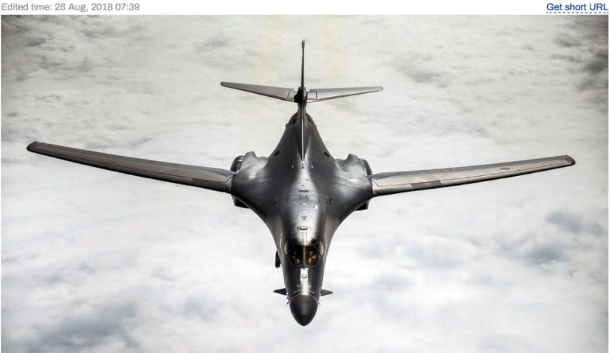
FILE PHOTO A US Air Force B-1B Lancer / AFP

Published time: 25 Aug, 2018 06:24 Edited time: 26 Aug, 2018 07:39