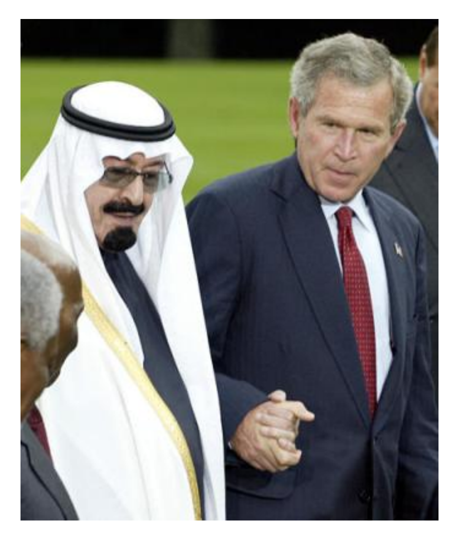
The Global War on Terrorism's "New Normal": "Good Guy" Terrorists

Establishing political ties with "State sponsors of terrorism" is now considered to be part of a "New Normal", a humanitarian endeavor intent upon spreading American democracy Worldwide.