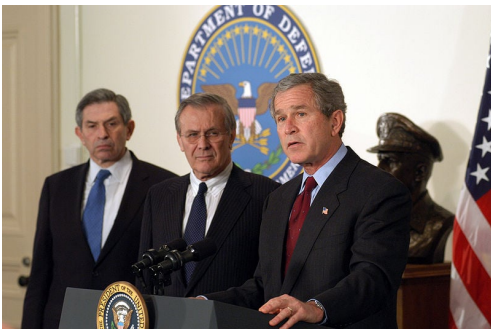
Paul Wolfowitz ("entrepreneurship and development"),

A glance at the AEI website lists those including: