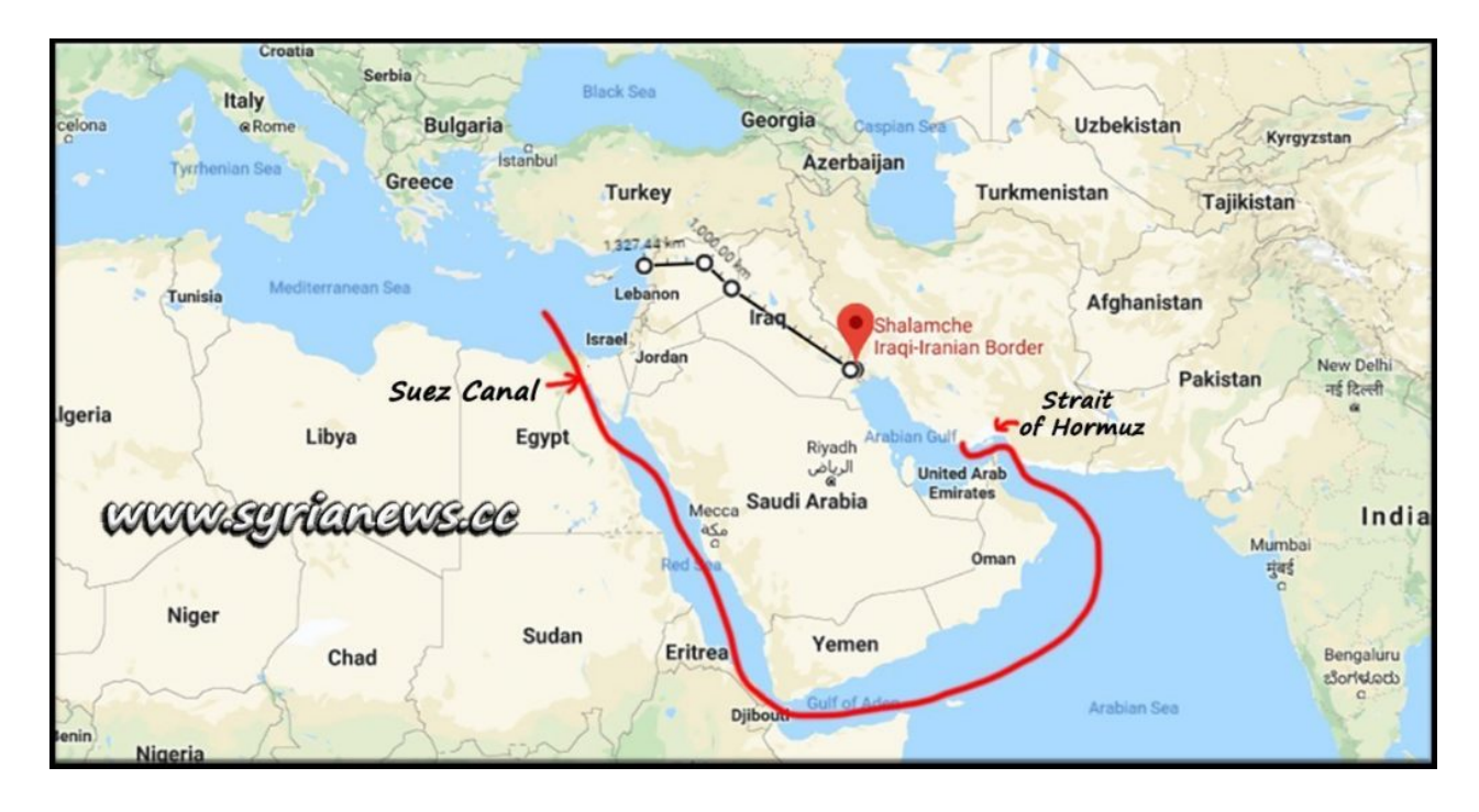
Iran will bypass the Strait of Hormuz, Arabian Sea, Gulf of Aden, Red Sea and Suez Canal to reach the Mediterranean

The link will be through a railway line between the Iranian cities of Shalamche with a length of 32 km with Iraqi Basra and the line will continue after that towards Syria, where the port of Imam Khomeini on the Iranian side of the Gulf waters will link with the Syrian port of Latakia in the Mediterranean.