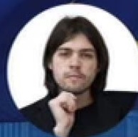
IVAN VILIBOR SINČIĆ

Non-attached Member of the European Parliament