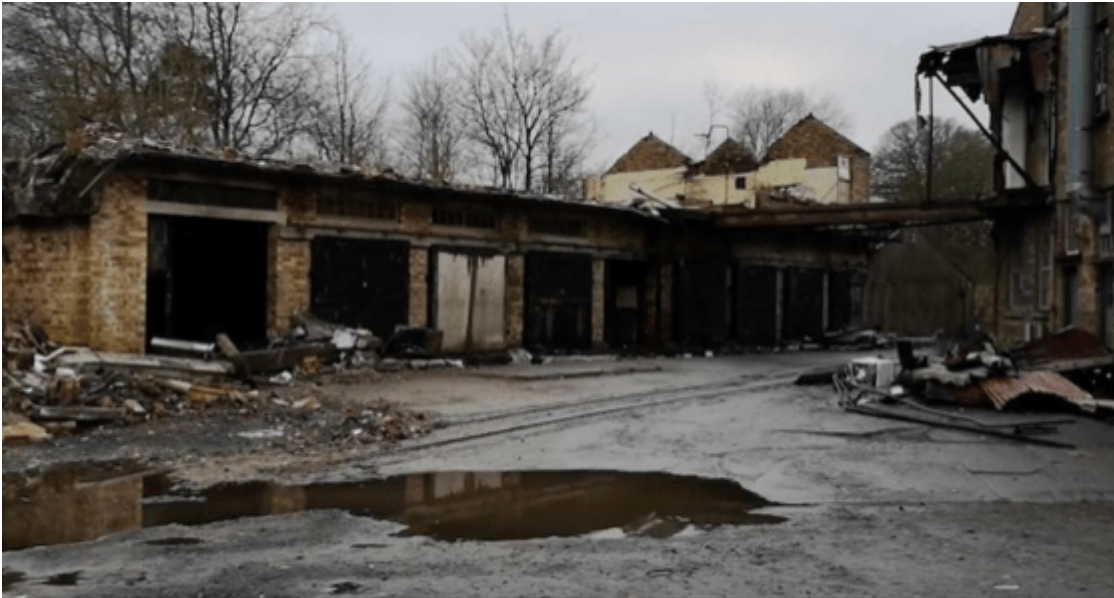
The partially demolished address at Gateside Mills.