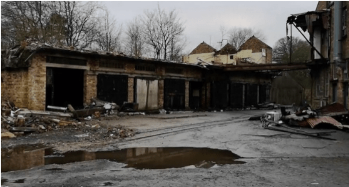
The partially demolished address at Gateside Mills.