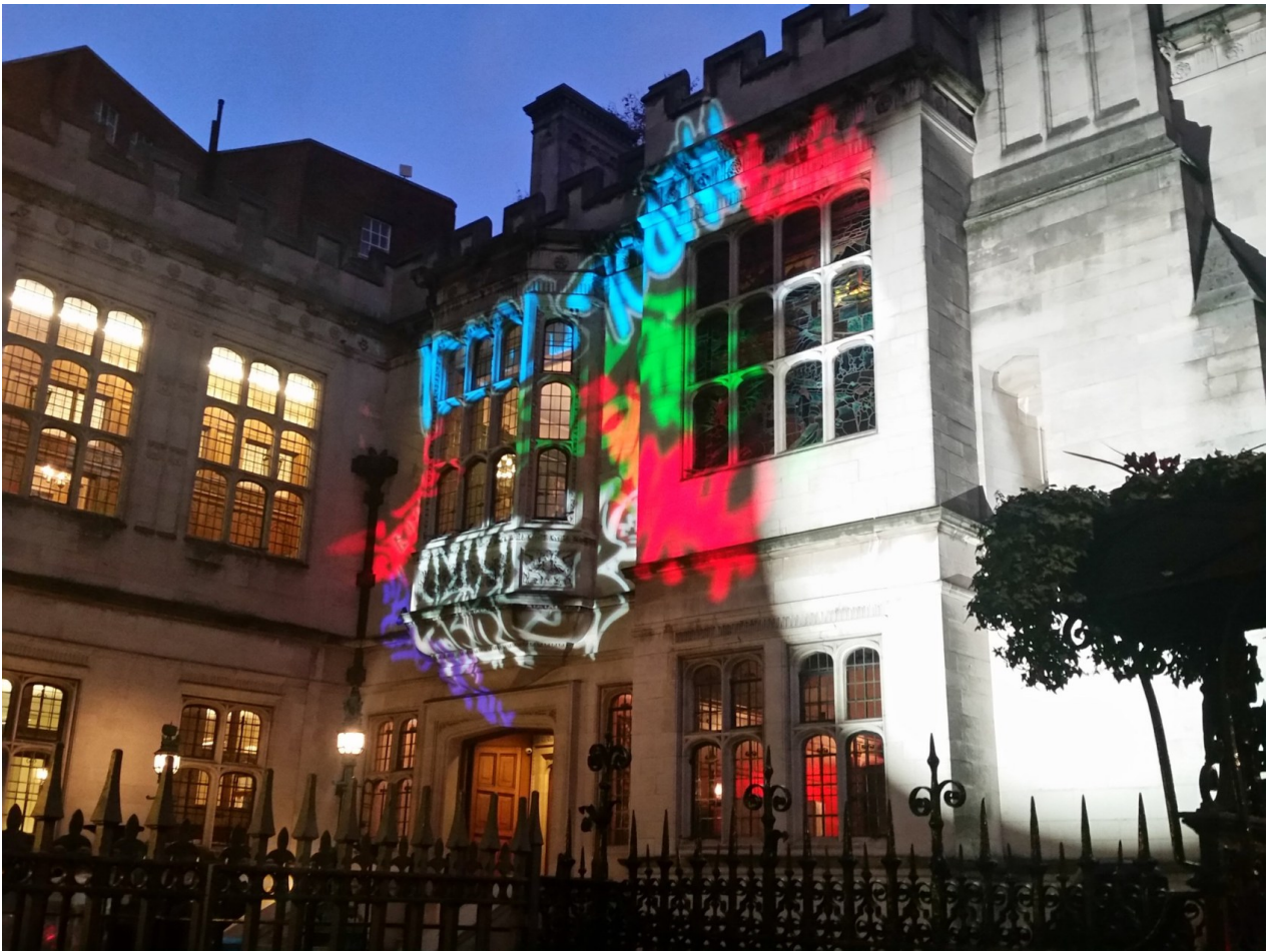
A Christmas themed projection lights up the walls of 2 Temple Place.

Elmaazi found the offices on December 6, having nearly given up and becoming convinced that he would discover nothing more than was found at the derelict house in Fife. When he arrived at the location, preparations were underway for some sort of Christmas-themed event to be held in the main building on the ground floor. But upon discovering the signs pointing downstairs to the basement, Elmaazi found himself staring at a door with a sign that read, “The Institute for Statecraft / The Fore.”