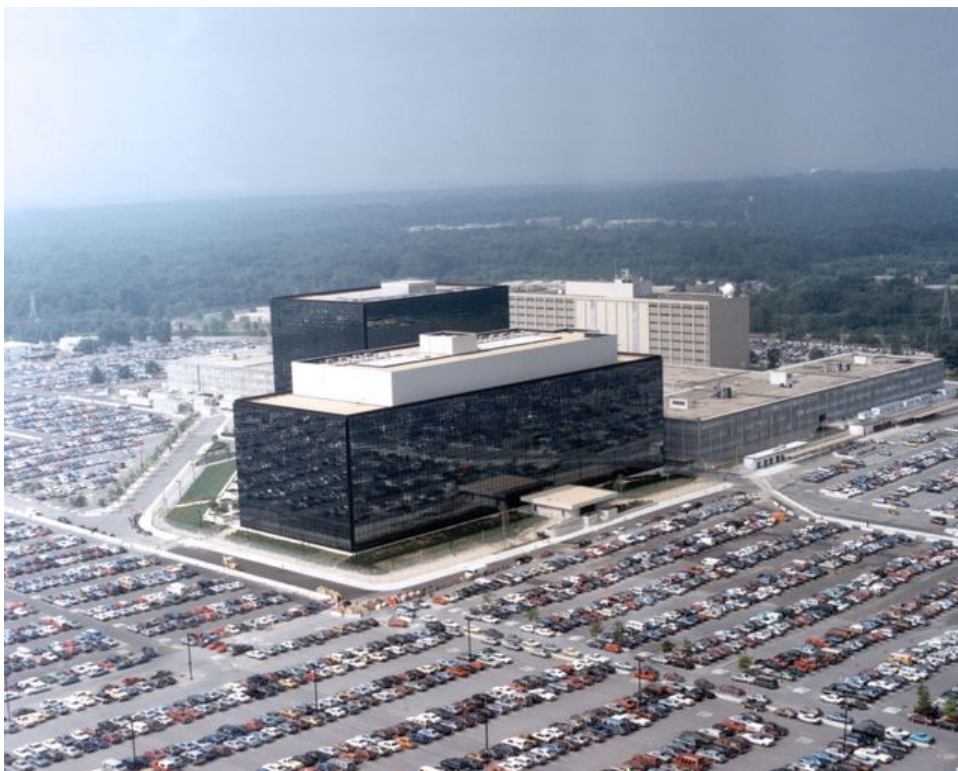
Headquarters of the NSA at Fort Meade, Maryland. Beneath the dark glass is a skinlike covering of thin orange-

Prior to Snowden's revelations, available published information about the NSA's signals intelligence systems has been limited. Much of what is presented here is derived from the work of James Bamford, journalist and intelligence expert and author of several books on the NSA including The Shadow Factory: The Ultra-Secret NSA from 9/11 to the Eavesdropping on America (2008).