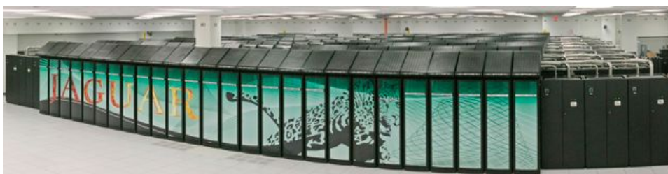
The XT5 Jaguar supercomputer developed by Cray and the NSA that became the fastest computer in the world in 2009 at 1.75 petaflops. The system has 200 cabinets with 37,500 quad core processors, 300 TB of RAM and 10,000TB of disk

Presently, the NSA is building a facility called the Utah Data Center that is scheduled to open in September of this year. The $2 billion construction project in Bluffdale, 20 miles south of Salt Lake City, will be the largest cloud-based data storage facility in the world and the hub of the NSA’s cyber-espionage operations. At more than 1 million square feet, the top-secret and self-sustaining complex will host servers capable of storing yottabytes of data. A yottabyte (1024 bytes) is 1 trillion terabytes.