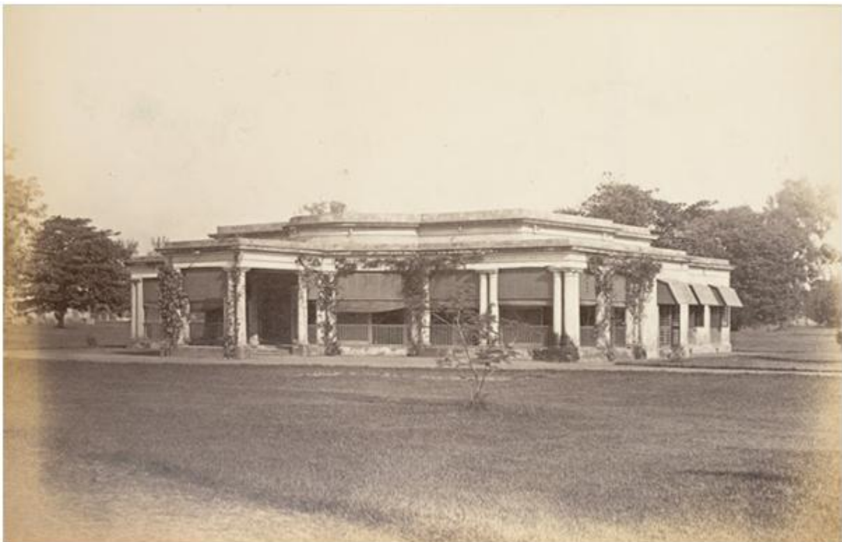
Image 3: Honeymoon Lodge, Barrackpore Park, Bengal, 1878. This was the pleasure house