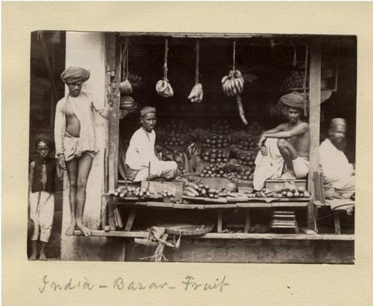
Image 2: India's Fruit Bazaar, 1880. Nearly hundred years after the British occupation of India, the signs of severe malnutrition were already visible.