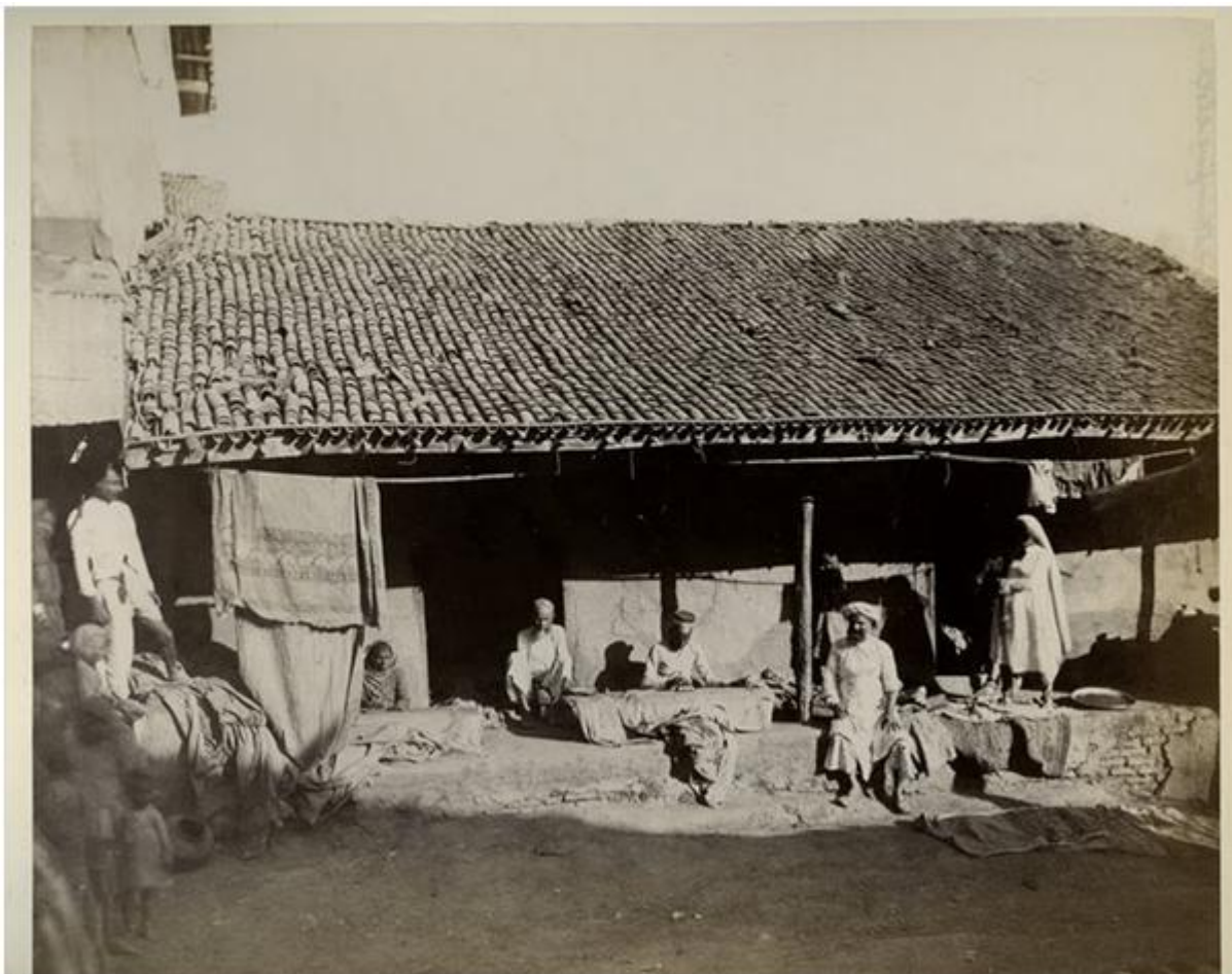
Image 1: Farmer's hut, 1880; these huts were better suited to the harsh Indian summer and the equally harsh winters. The clay tile roof not only drained rainwater, it insulated the home from heat and cold. These hollow clay tiles with air pockets insulate the home from the top. The clay walls keep the homes cool.

miserable for 377 million urban Indians.