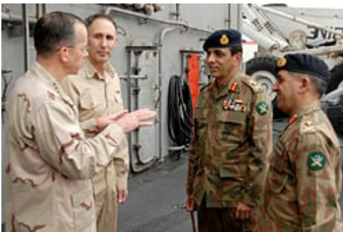
Lt. Gen. Ahmed Shuja Pasha (right) next to Gen. Ashfaq Kayani on the USS Abraham Lincoln talking with Michael Mullen, Chairman of the Joint Chiefs of Staff.

In other words, Washington exerts more control over the ISI than the duly elected civilian government of Pakistan.