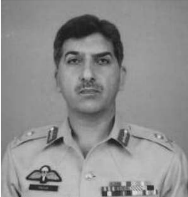
Lt. General Ahmed Shuja Pasha

In this regard, the pressures exerted by the Bush administration contributed to blocking a parliamentary initiative led by the PPP government to put the country's intelligence services (ISI) under civilian authority, namely under the jurisdiction of the Ministry of Interior.