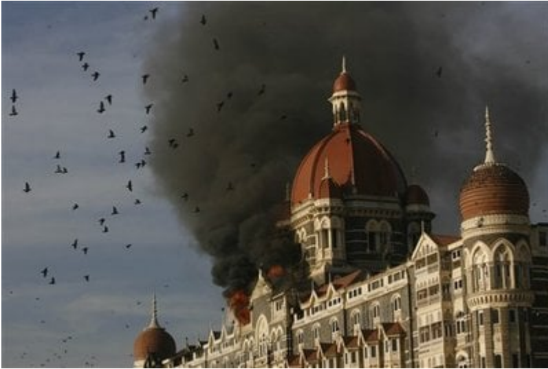
Taj Mahal Hotel

The gunmen also opened fire at Café Leopold , a stylish restaurant in the tourist area. The third target was Nariman House , a business center which houses Chabad Lubavitch, Mumbai's Jewish Center. Six hostages including the Rabbi and his wife were killed.